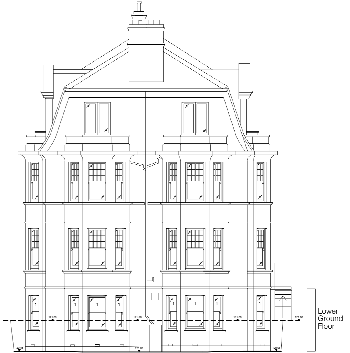
Front (West) Elevation