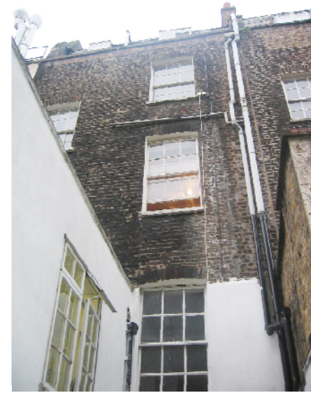
03 SOUTH ELEVATION PL100