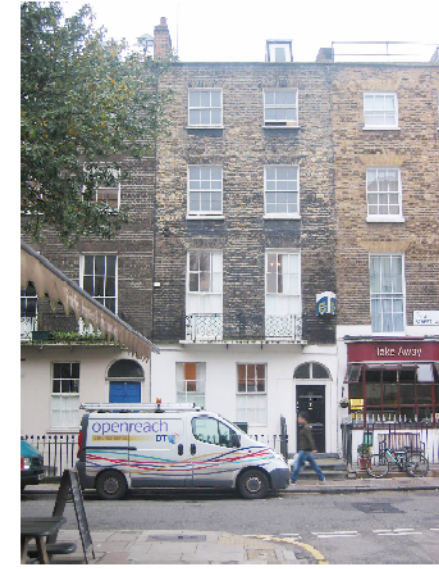
02 NORTH ELEVATION LEIGH STREET PL100