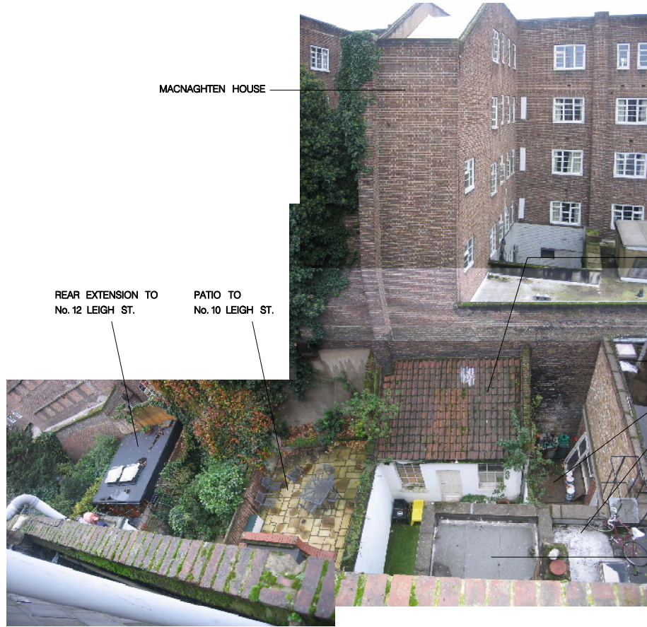
04 VIEW FROM ROOF LEVEL TOWARDS THE SOUTH PL100