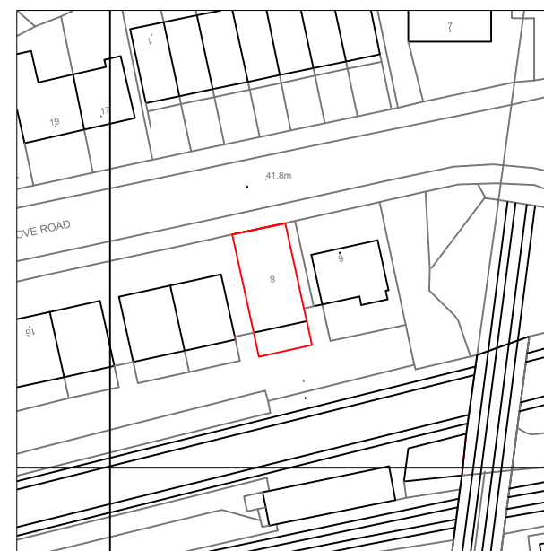
LOCATION PLAN Scale: 1:1250