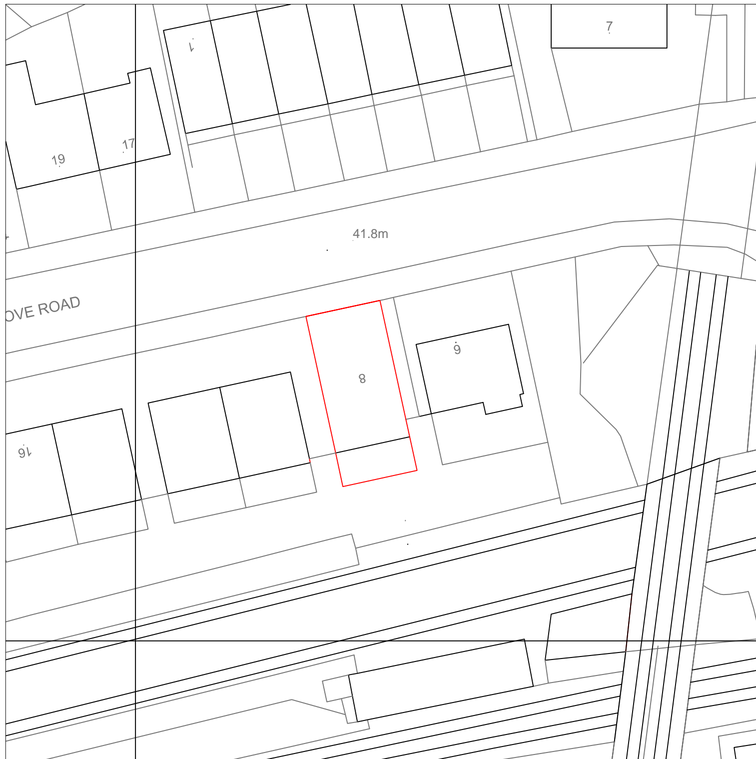
SITE PLAN Scale: 1:500