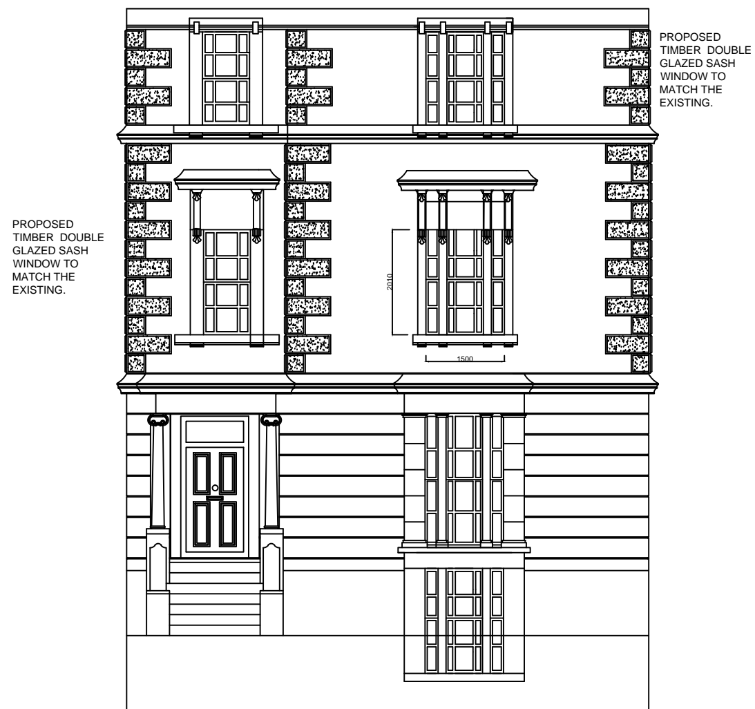
FRONT ELEVATION (PROPOSED)

The fenestration will be followed to the front and rear elevation.