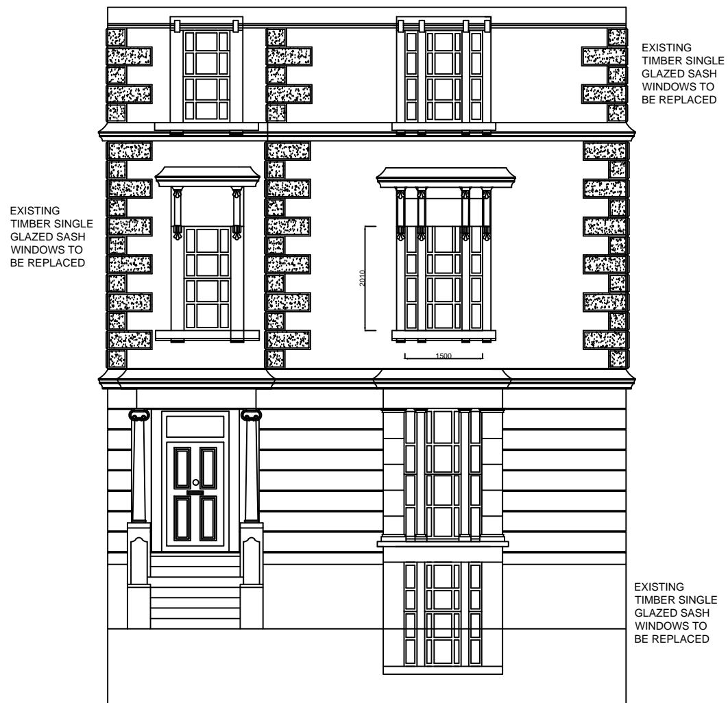
FRONT ELEVATION (EXISTING)