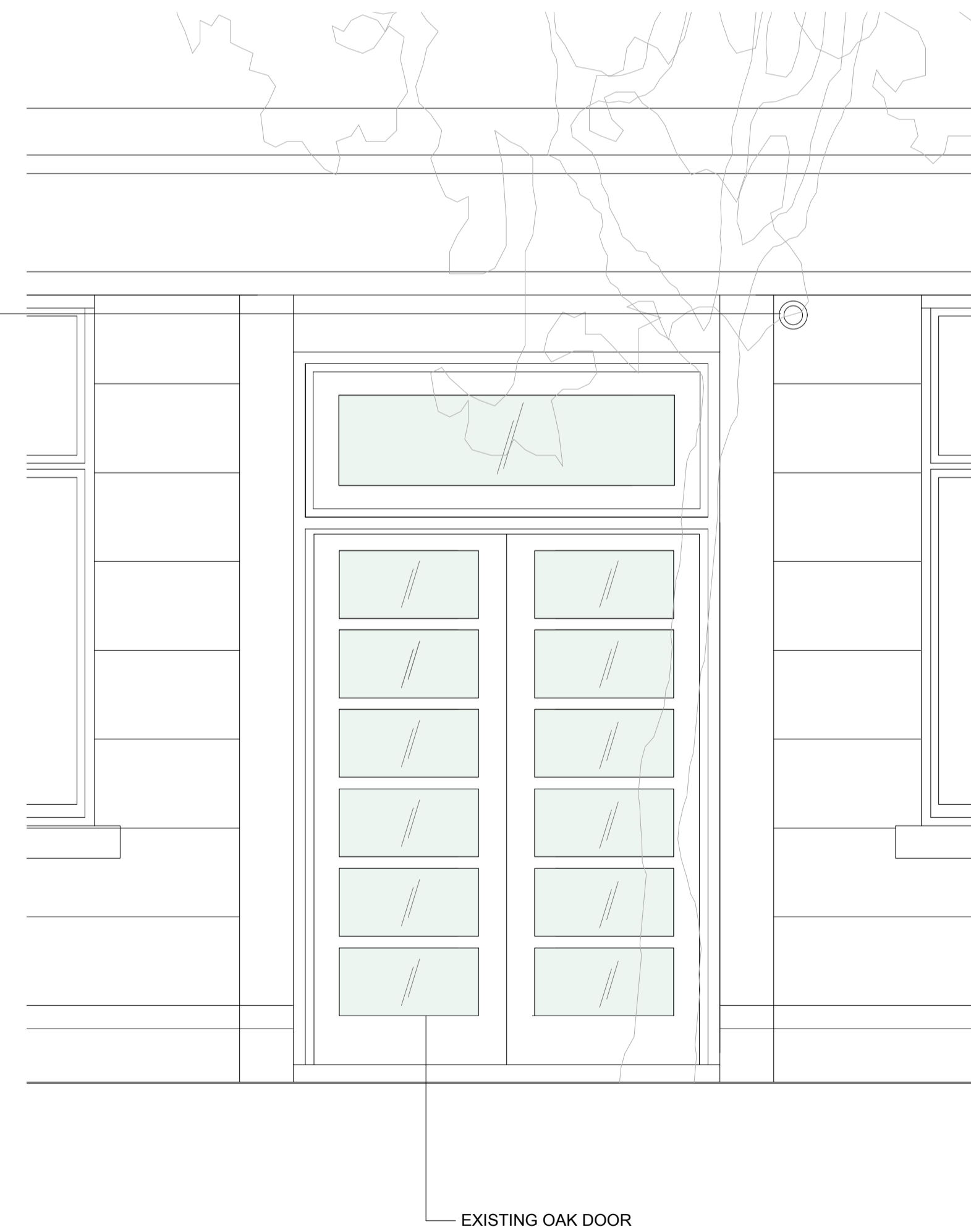
3 EXISTING PLAN DETAIL Scale: 1:20