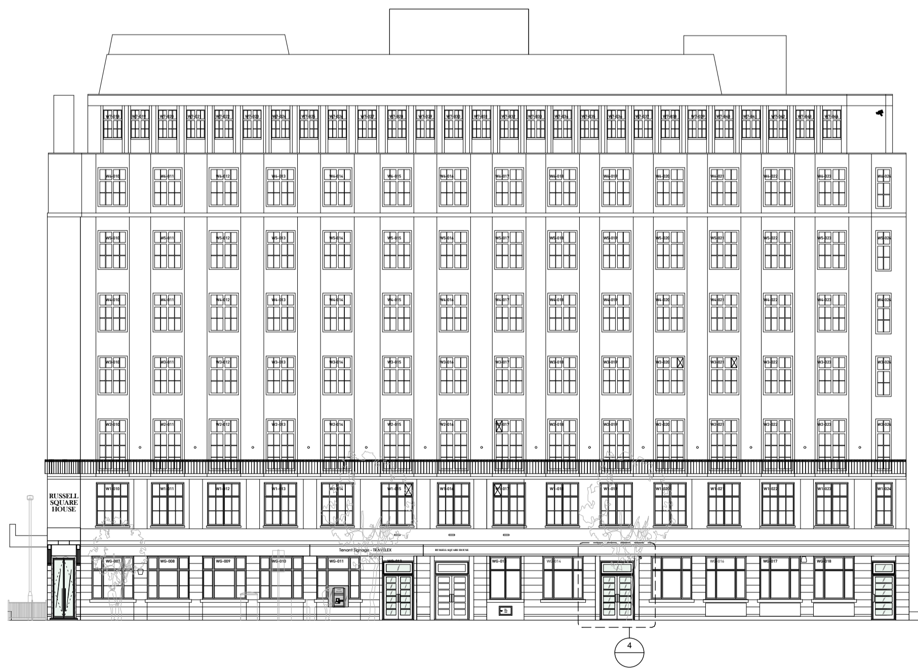
2 NORTH EAST ELEVATION - WOBURN PLACE Scale: 1:200