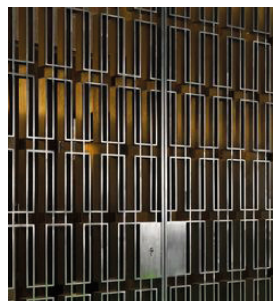
Possible pattern of screen