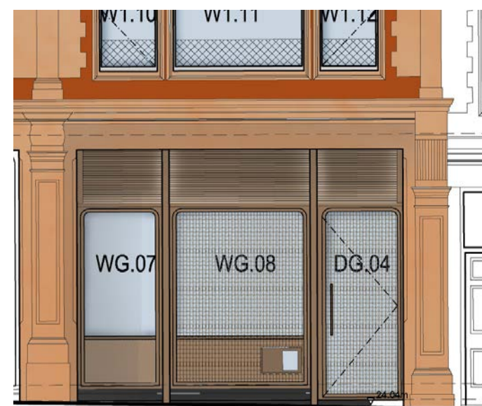
Location of the screen