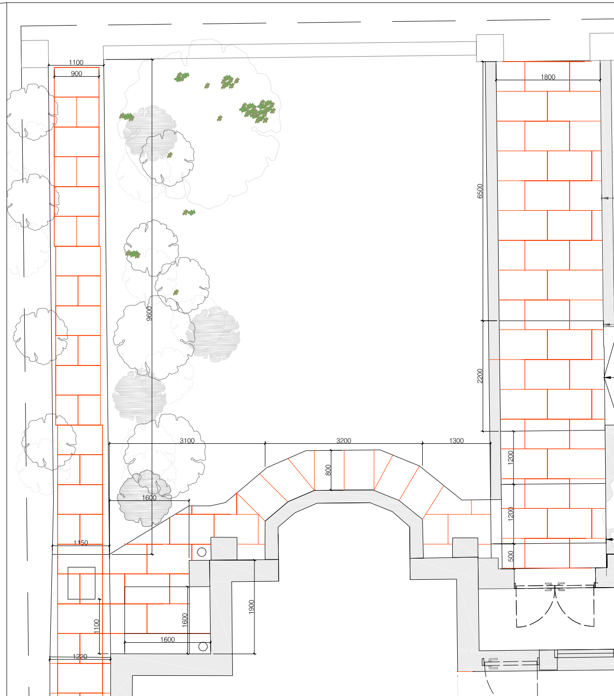
FRONT PATHS FLOOR PLAN 1/75