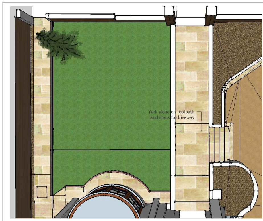
ILLUSTRATION FLOOR PLAN N/S