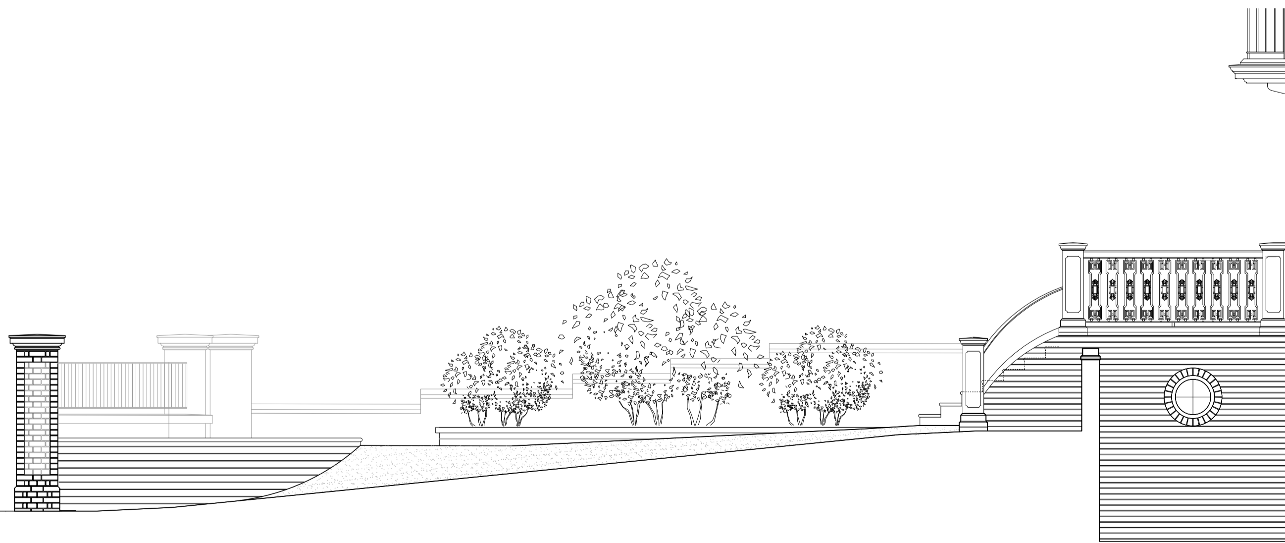
Front Boundary Wall: Section 2: 1:50 @ A1