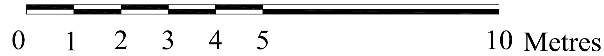
Avenue Road elevation

REVISION B :- 01.06.2016 PLANNING APPLICATION SUBMISSION REVISION A :-11.11.2015 PRE APP SUBMISSION