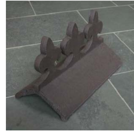
NEW DECORATIVE RIDGE TILE

ALL EXISTING LEADWORK TO BE REPLACED WITH NEW CODE 8 LEAD.