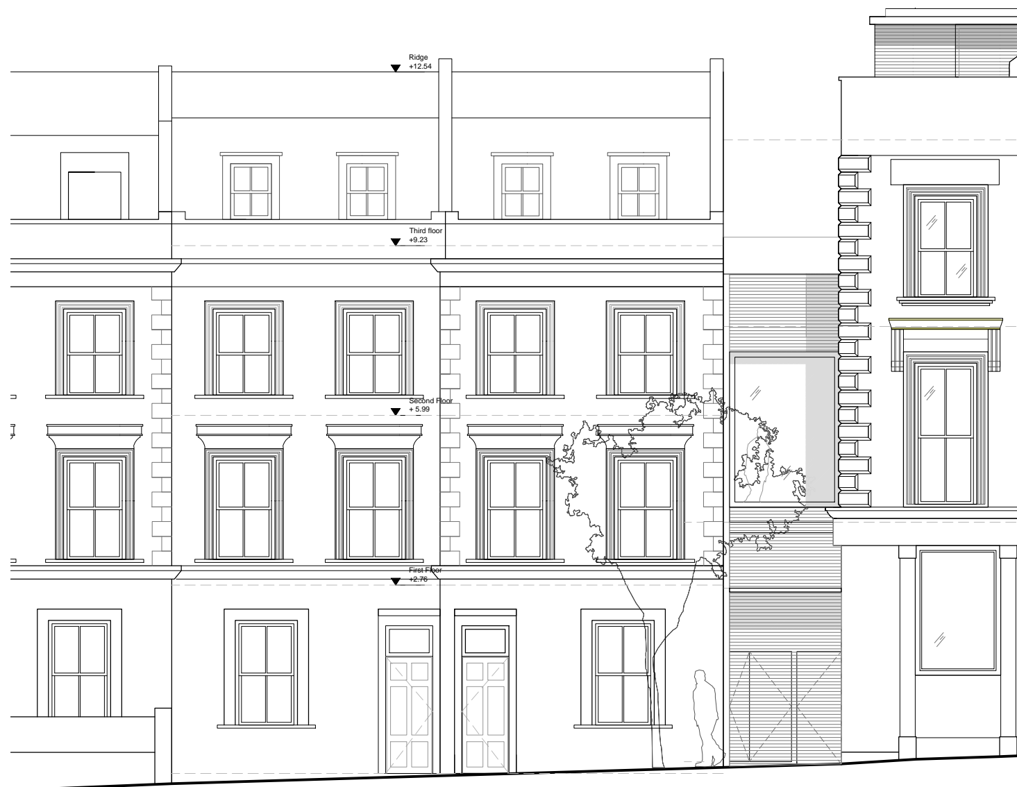
PROPOSED FRONT ELEVATION 1:100@A3 / 1:50@A1

All windows have glazing film fixed between two panes of glass and is therefore not removable/ lower part of window is fixed