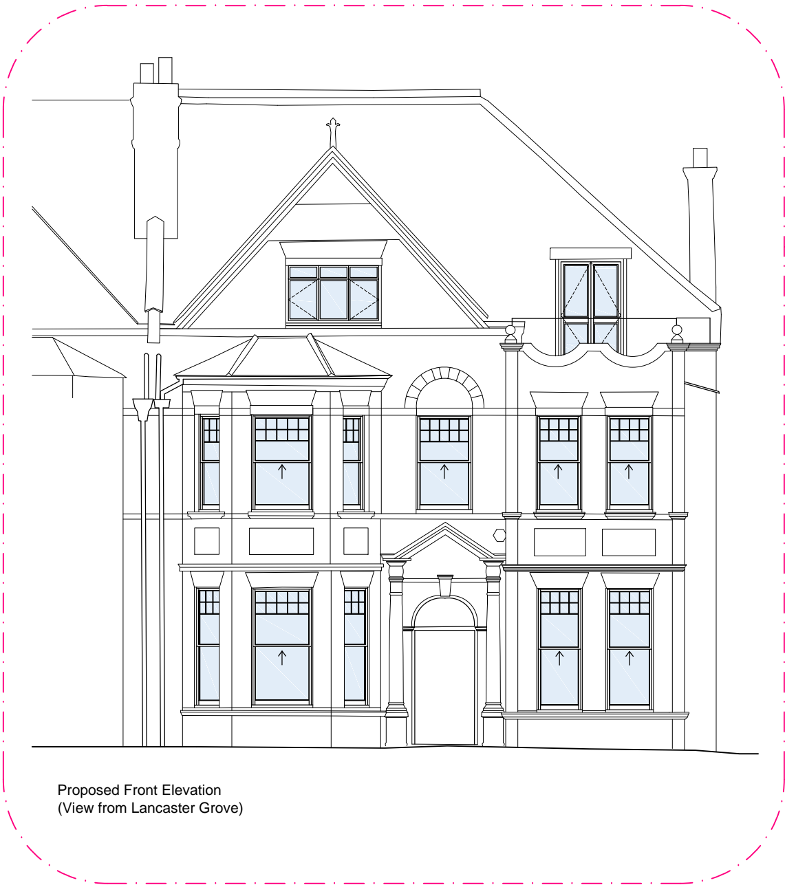
Proposed Front Elevation (View from Lancaster Grove)

FOR FURTHER DETAILS REFER TO DRAWING FIS_51