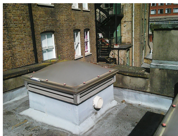
Temporary collective fall protection to be installed around lower area of parapet during works.