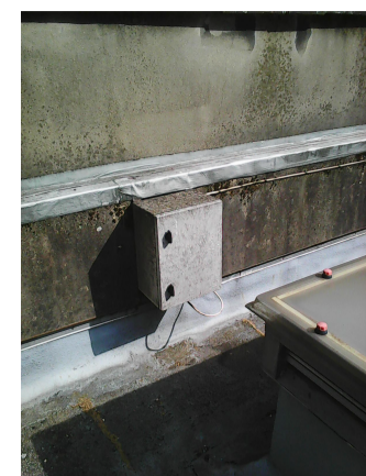
Existing, redundant electrical box and connected wiring to be removed. Fixing locations to be made good.

Any work beyond the line of the higher parapet to be planned. Zone to be visibly demarked during works.