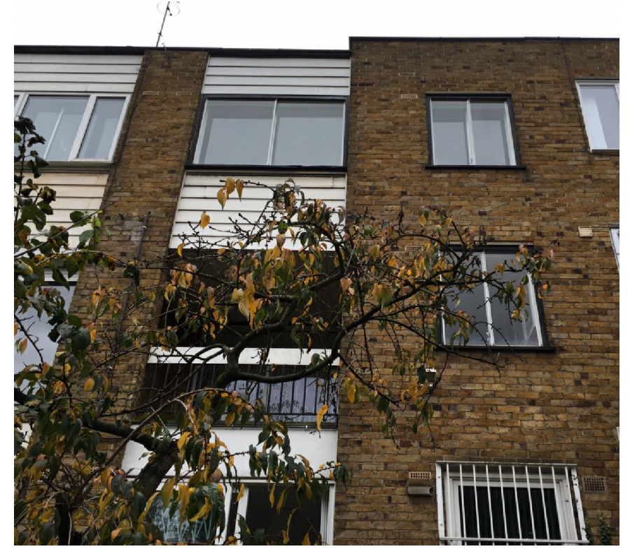
Site Photograph - Rear Elevation