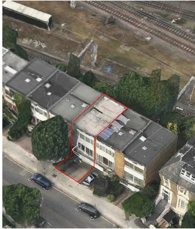
Aerial Photograph - Front Elevation