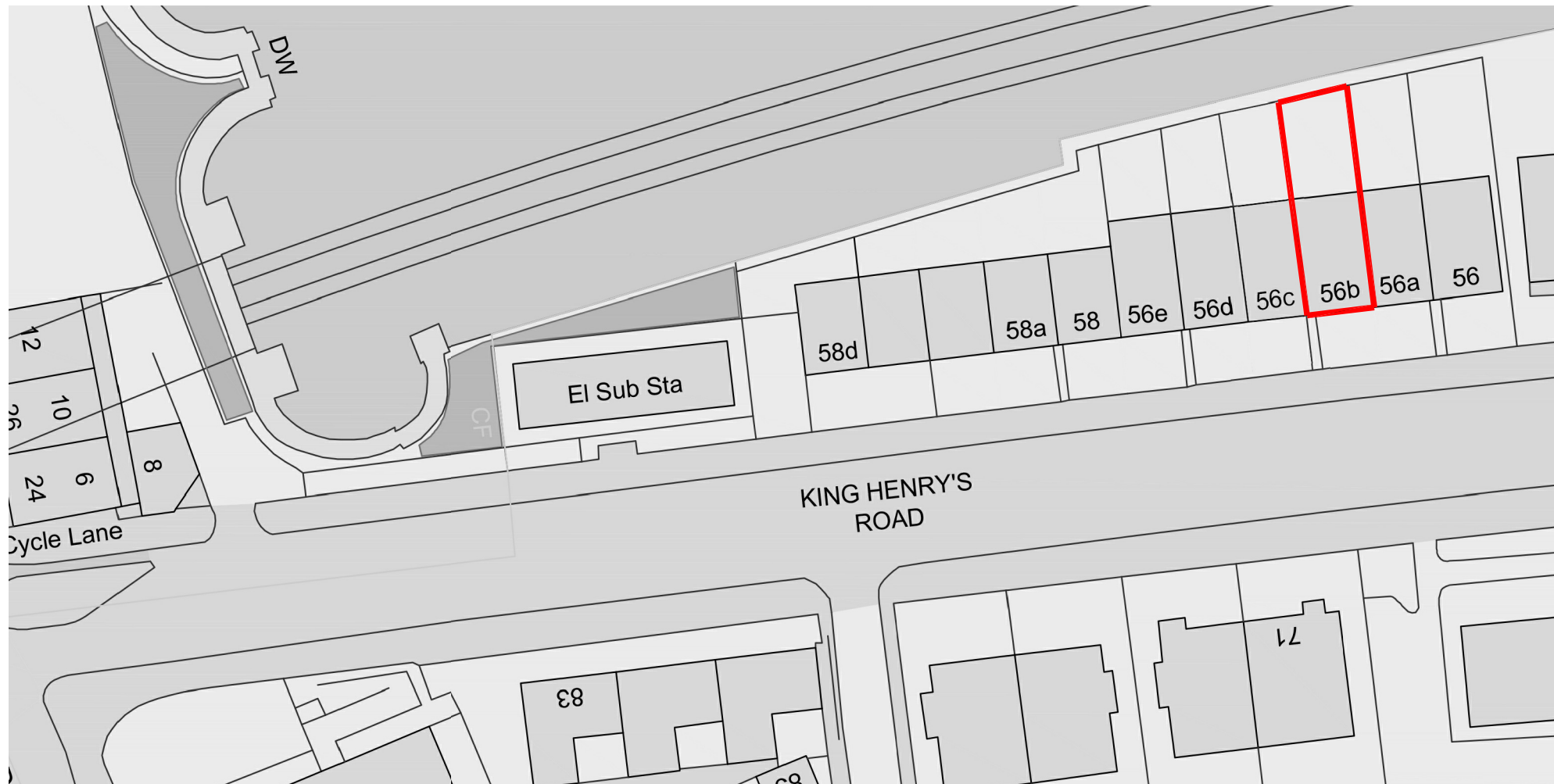
Site Plan 1:500