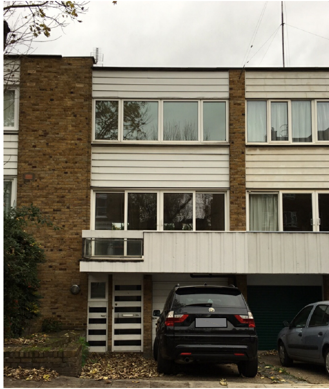
Site Photograph - Front Elevation