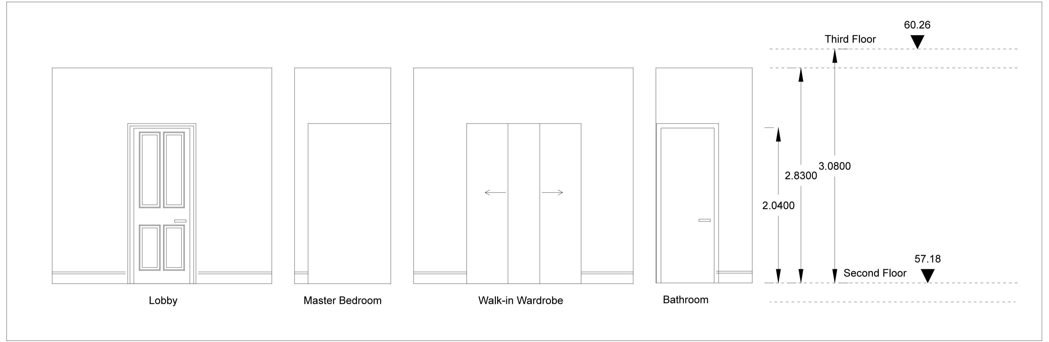
Level 02 Elevations