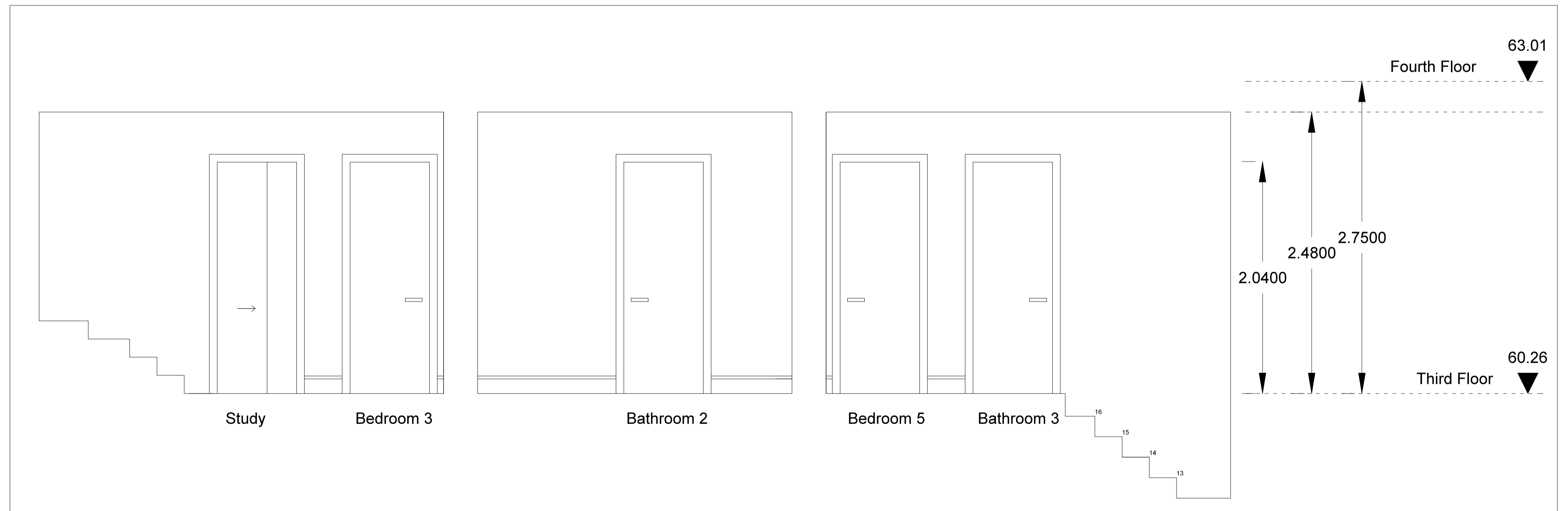
Level 03 Elevations

Project: The Clockhouse, 11 John Street, WC1N 2EB