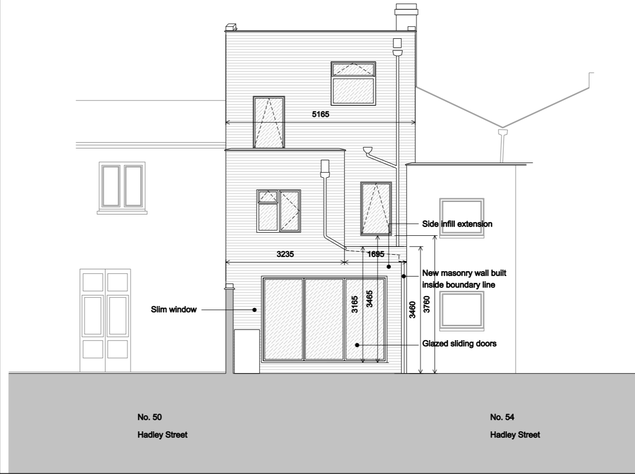
REAR ELEVATION 02