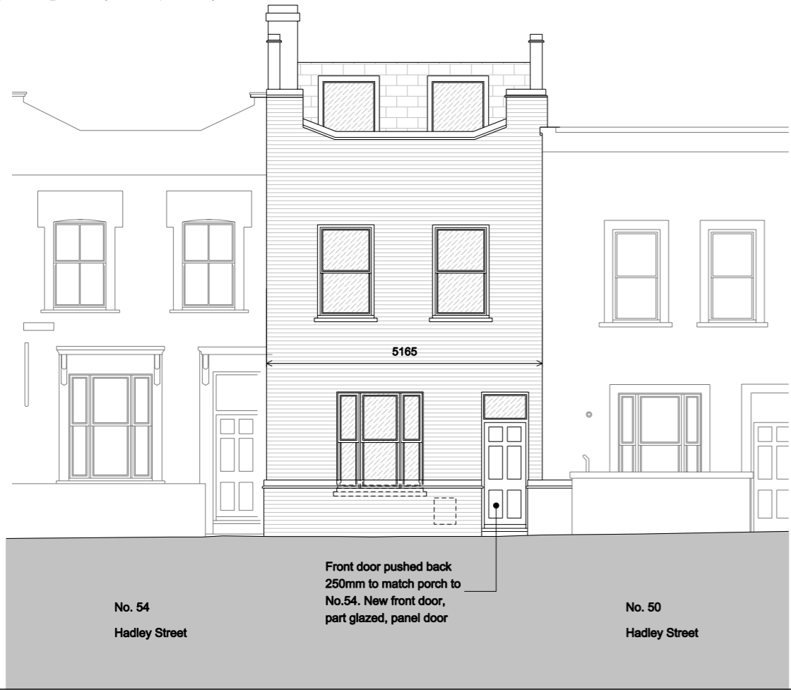
FRONT ELEVATION 01