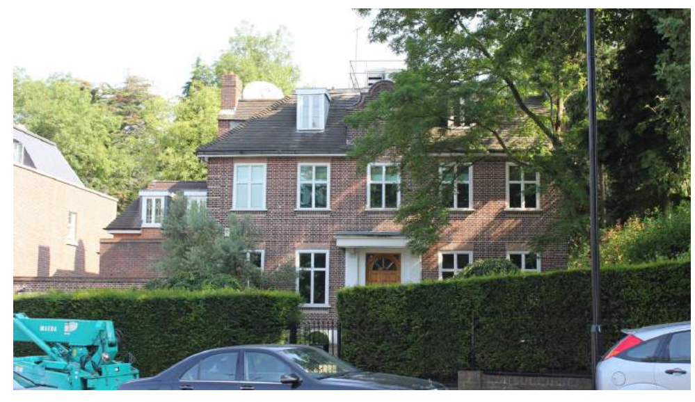
26. Large mansion-style house located on Hampstead Lane.