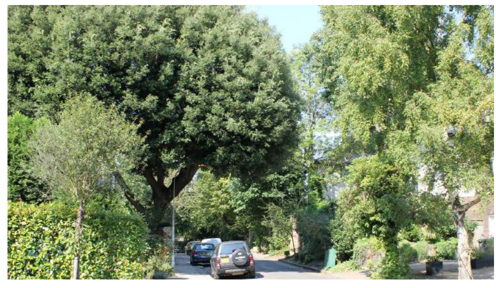
37. Green character but generally smaller tree species such as silver birch.