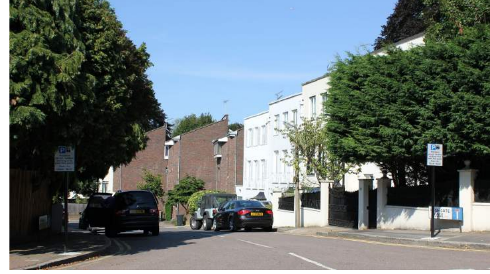
33. Fewer trees along Highgate Close.