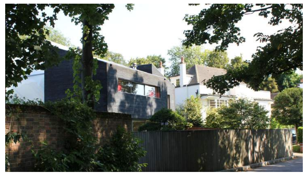
40. Large modern dwellings set back within landscaped grounds.