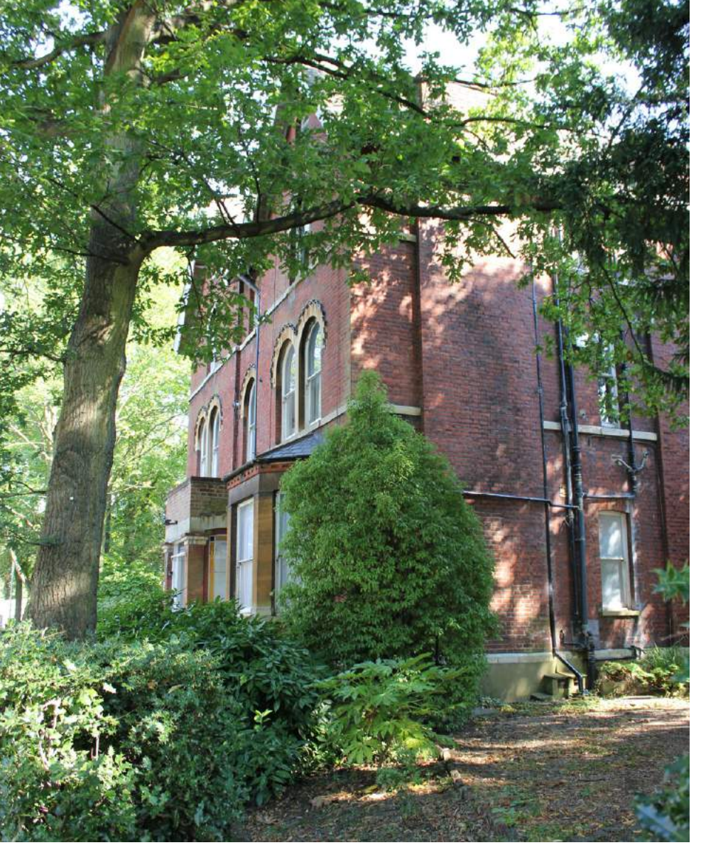
25. Large dwelling located on Bishopswood Road, opposite Highgate School playing fields.