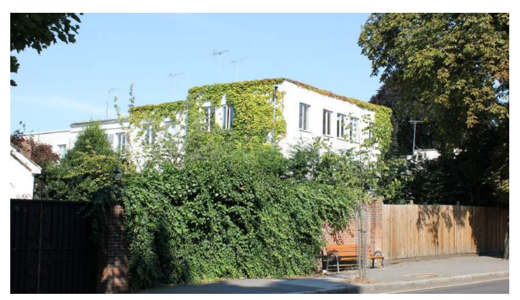
34. Smaller scale terraced dwellings.