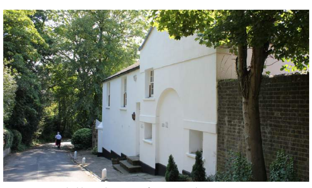
39. Green wooded lane character of Fitzroy Park.