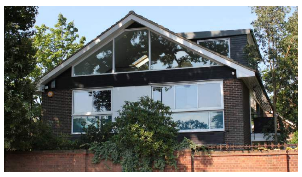
27. Large modern house set within landscaped grounds, located on Hampstead Lane.