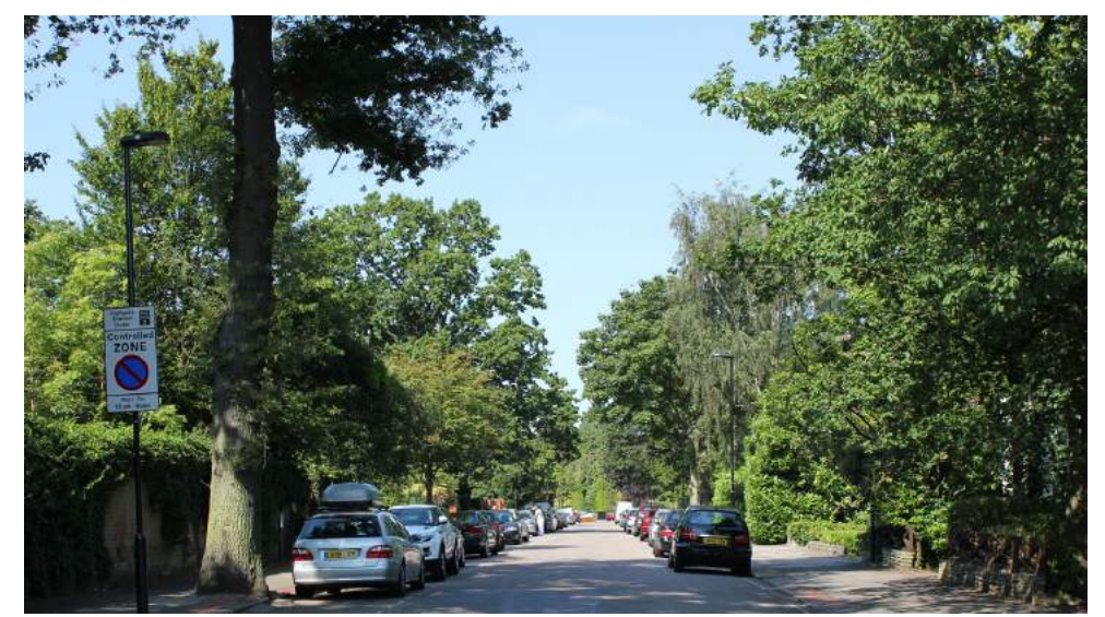
29. View north along Sheldon Avenue.