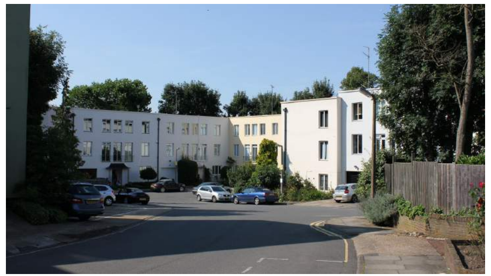
35. Terraced dwellings to cul-de-sac.