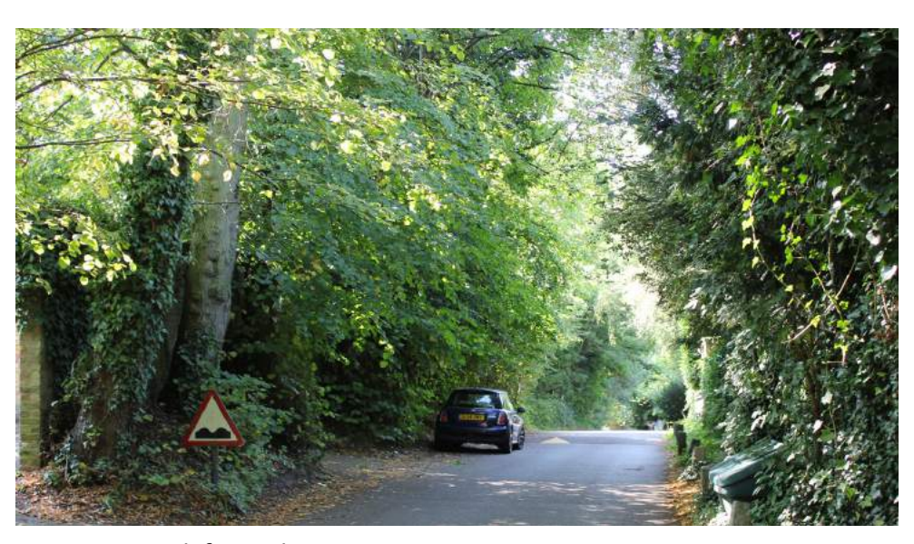
38. Fitzroy Park from The Grove