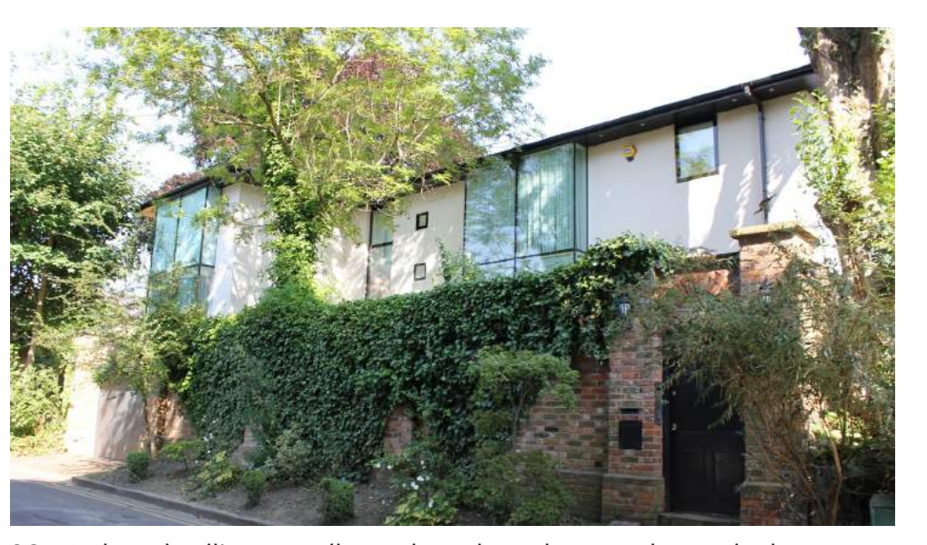
36. Modern dwellings, smaller scale and set closer to the road edge.