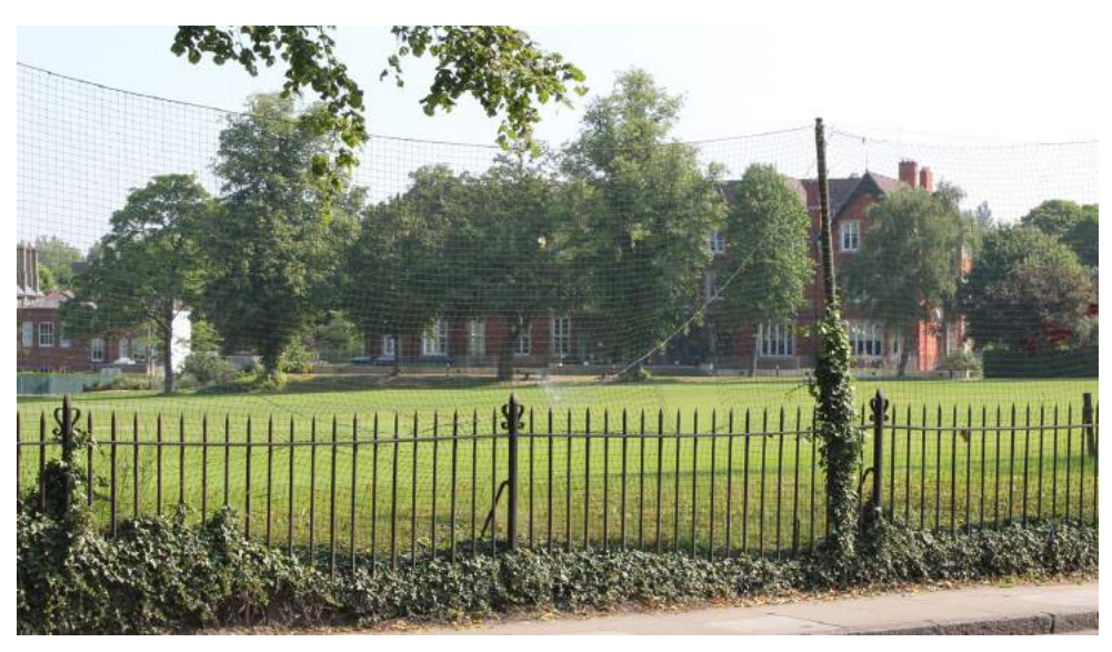
22. Highgate School playing fields boundary to Hampstead Lane defined by a simple metal railing.