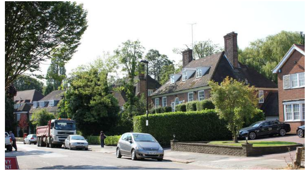
30. Dwellings along Sheldon Avenue, demonstrating consistent scale and 31. Modern house on Denewood Road. set back from road.