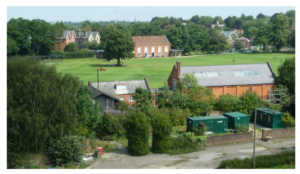
21. Highgate School playing field, as viewed from Athlone House tower.