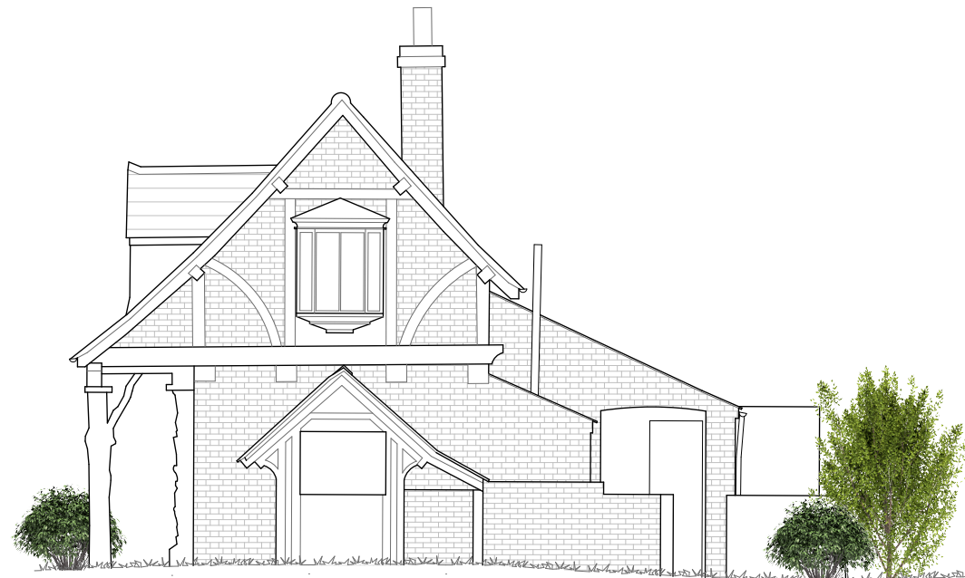
1 SCALE 1:100 @ A1, 1:200 @ A3 SOUTH ELEVATION - EXISTING

*NO EXTERNAL WORKS TO OCCUR ON THE GATE HOUSE - ONLY RESTORATION