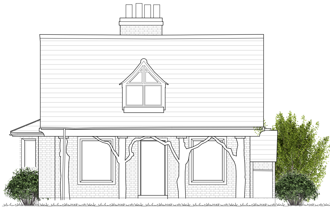
3 SCALE 1:100 @ A1, 1:200 @ A3 WEST ELEVATION - EXISTING

*NO EXTERNAL WORKS TO OCCUR ON THE GATE HOUSE - ONLY RESTORATION