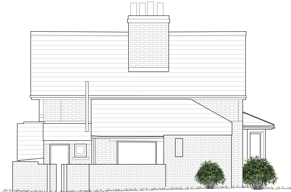
1 SCALE 1:100 @ A1, 1:200 @ A3 EAST ELEVATION - EXISTING

*NO EXTERNAL WORKS TO OCCUR ON THE GATE HOUSE - ONLY RESTORATION