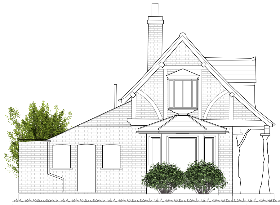
4 SCALE 1:100 @ A1, 1:200 @ A3 NORTH ELEVATION - EXISTING

*NO EXTERNAL WORKS TO OCCUR ON THE GATE HOUSE - ONLY RESTORATION