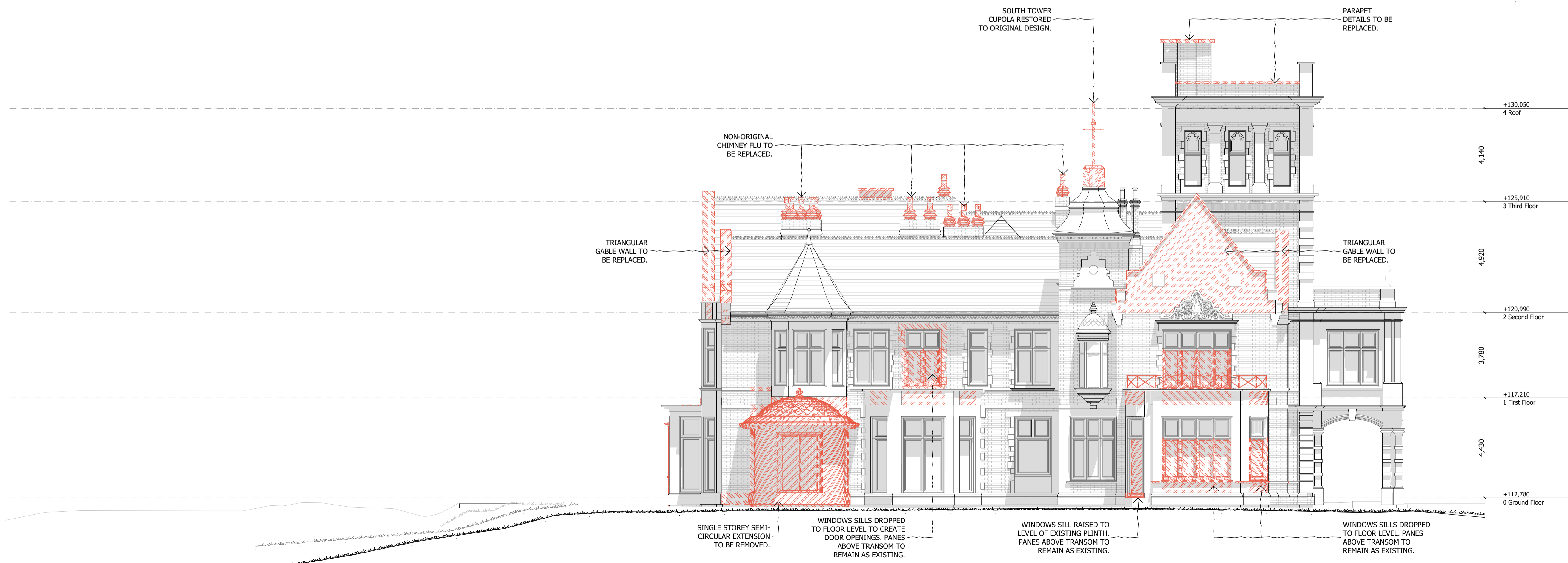
2 SOUTH ELEVATION - DEMOLITION