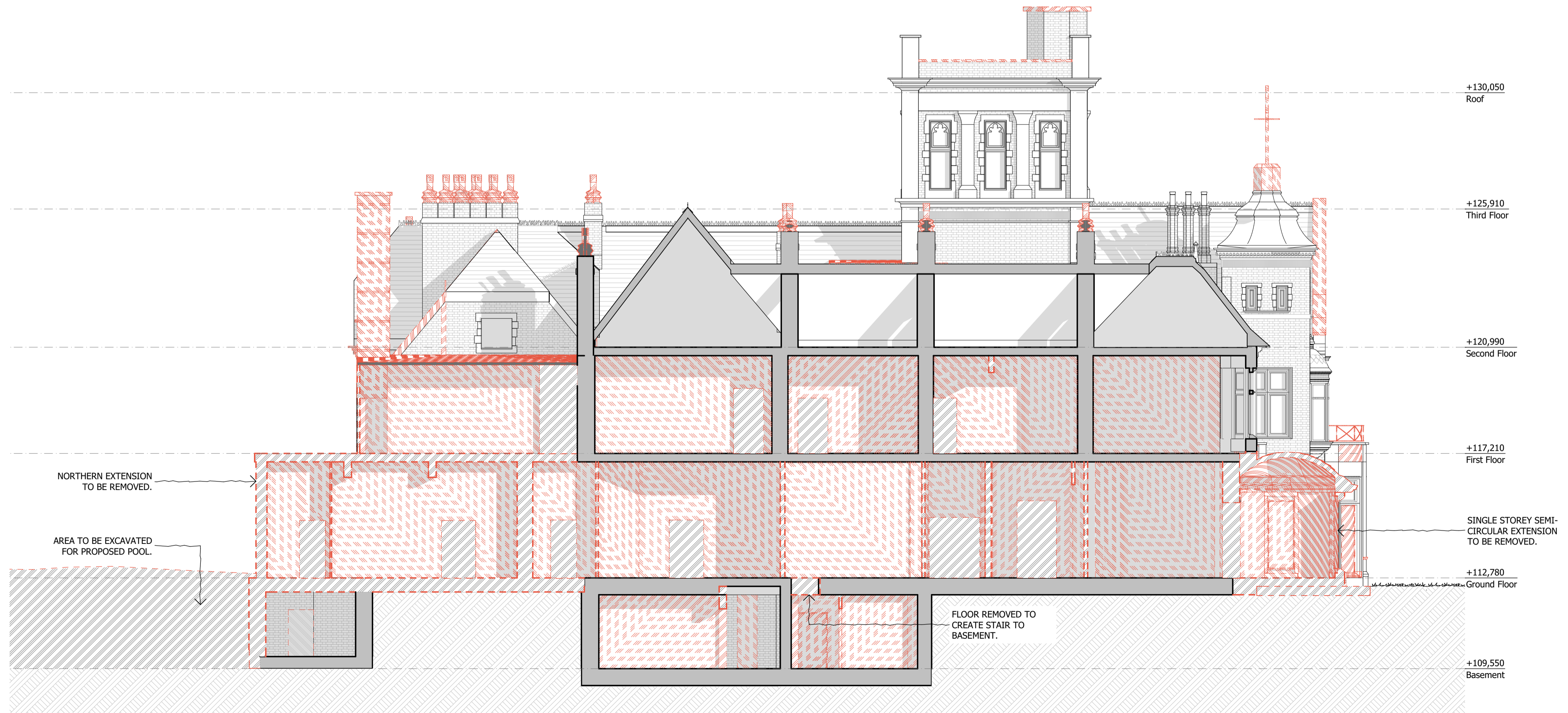
1 SCALE 1:100 @ A1, 1:200 @ A3 LONG SECTION DD - EXISTING