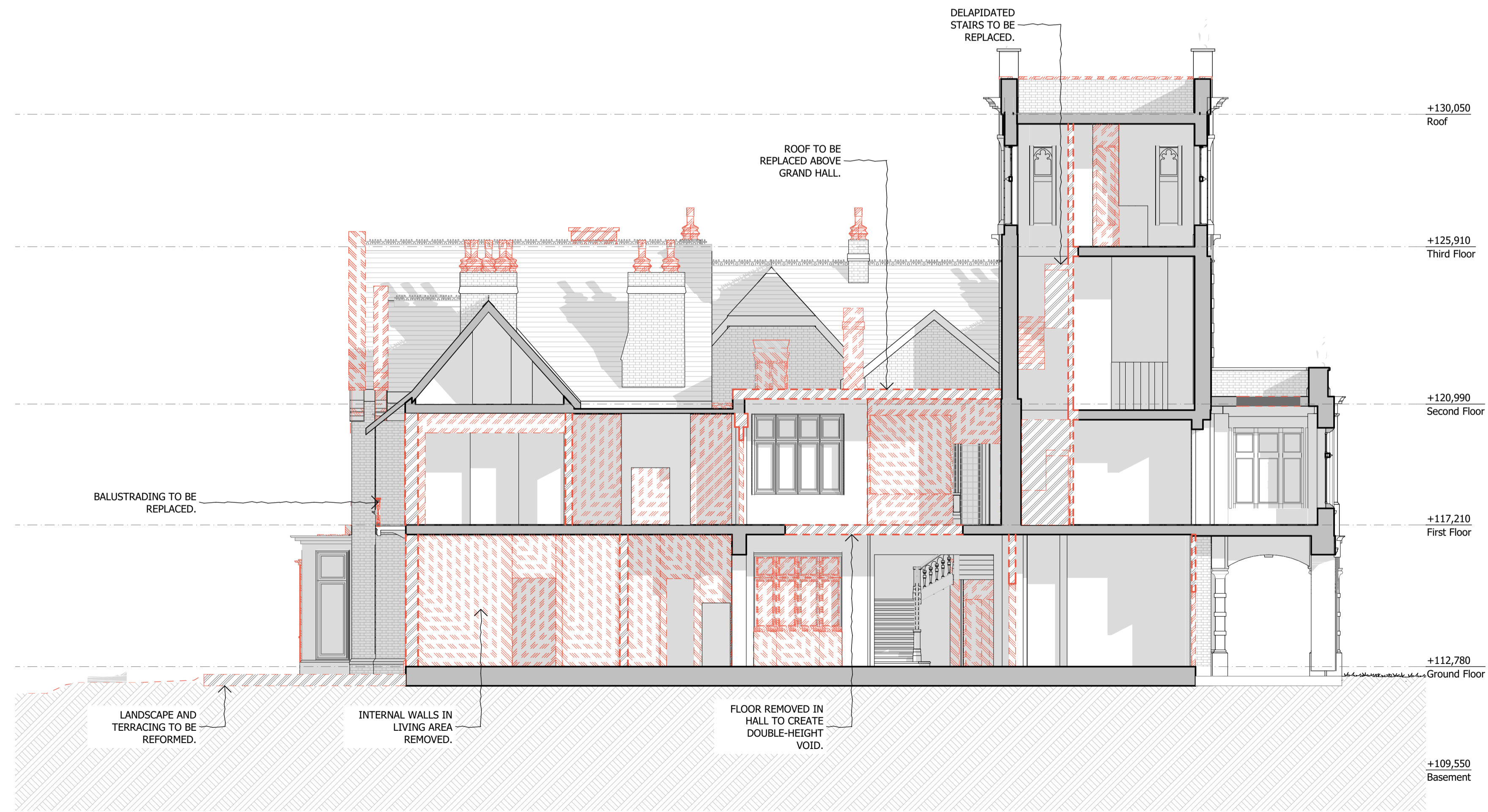
2 SCALE 1:100 @ A1, 1:200 @ A3 CROSS SECTION AA - DEMOLITION