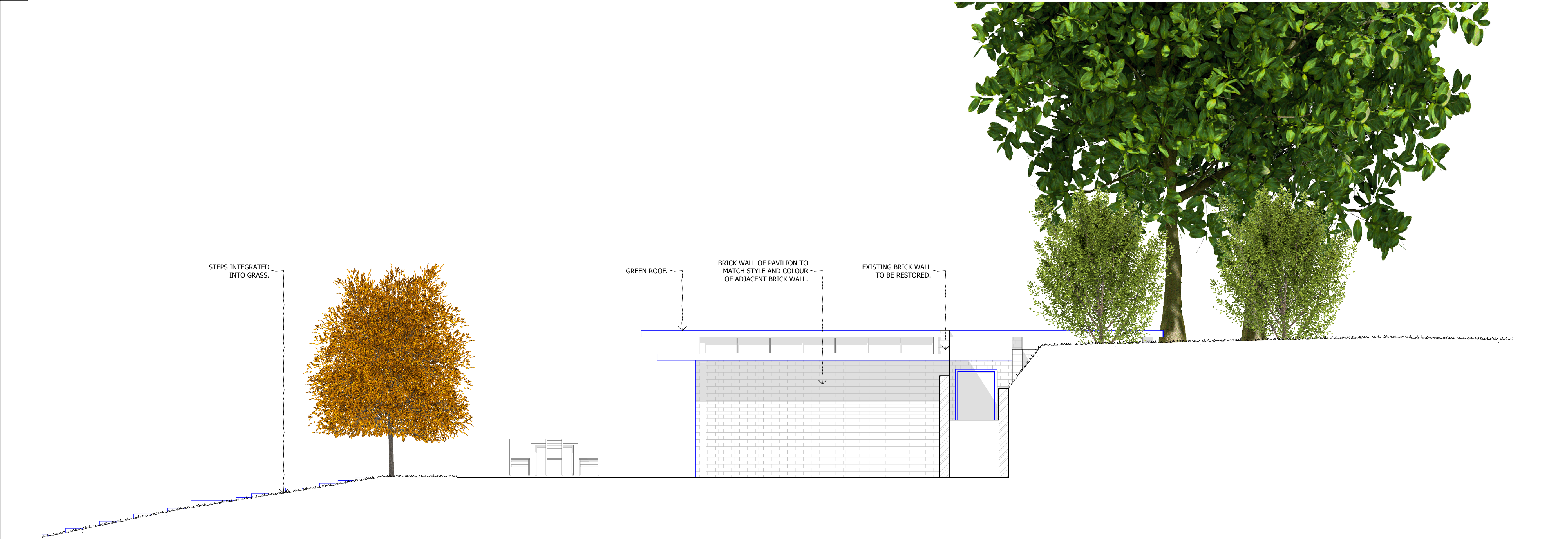
2 SCALE 1:50 @ A1, 1:100 @ A3 SUMMER PAVILION SIDE ELEVATION - PROPOSED