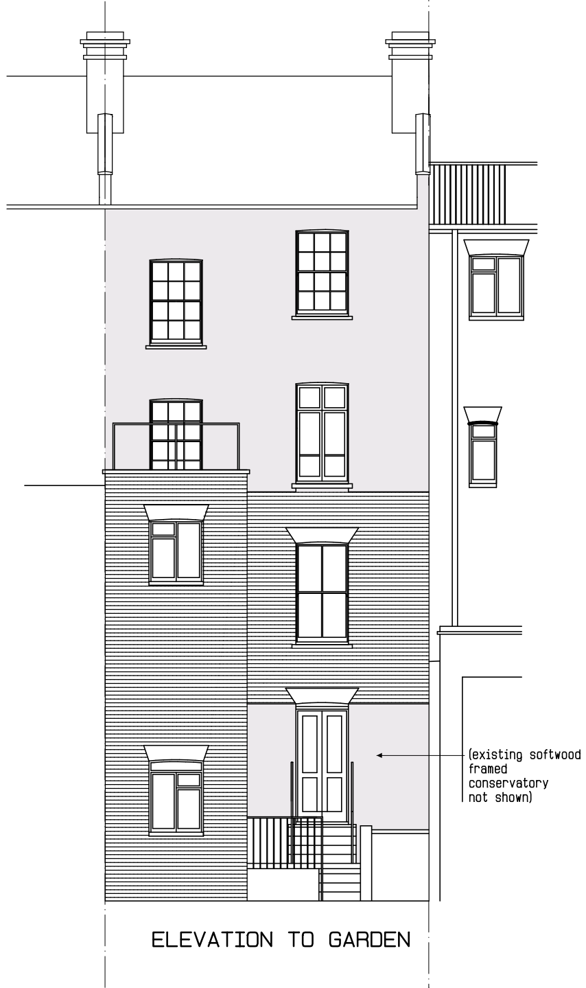
ELEVATION TO GARDEN