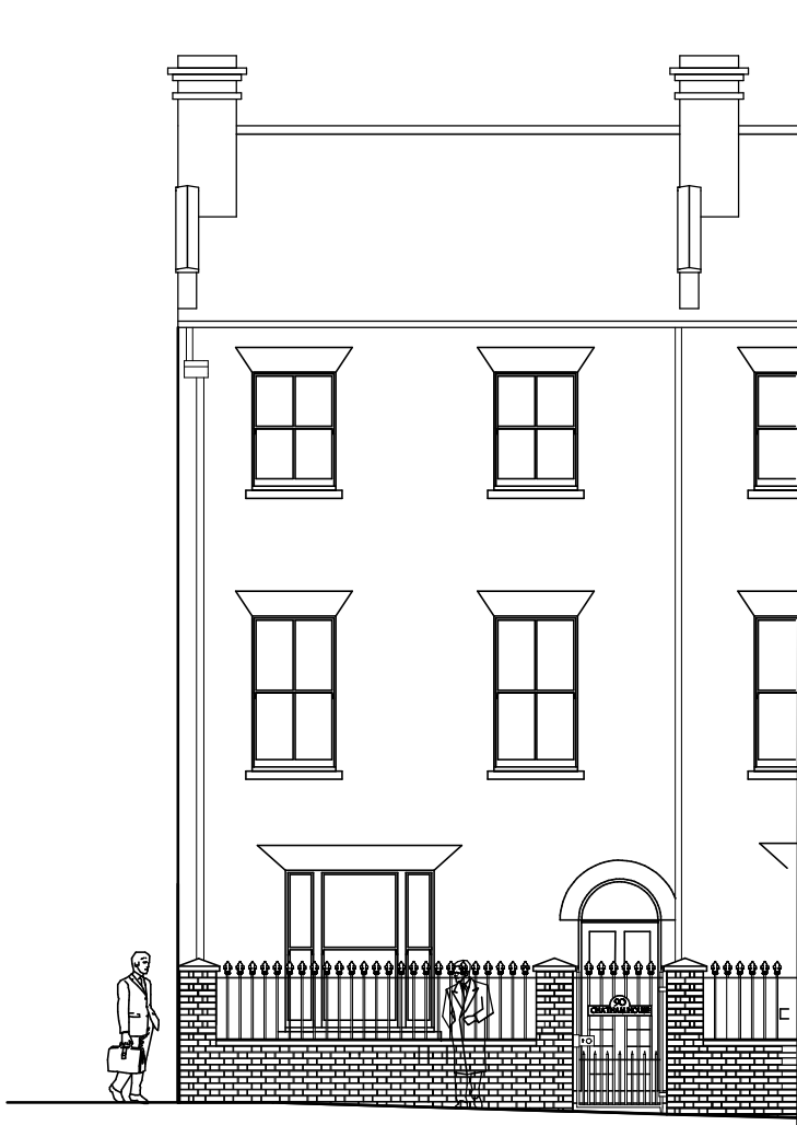
ELEVATION TO HEATH STREET UNALTERED