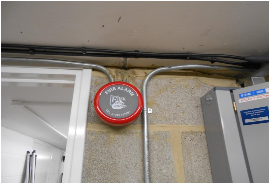
1585 Fracture at high level