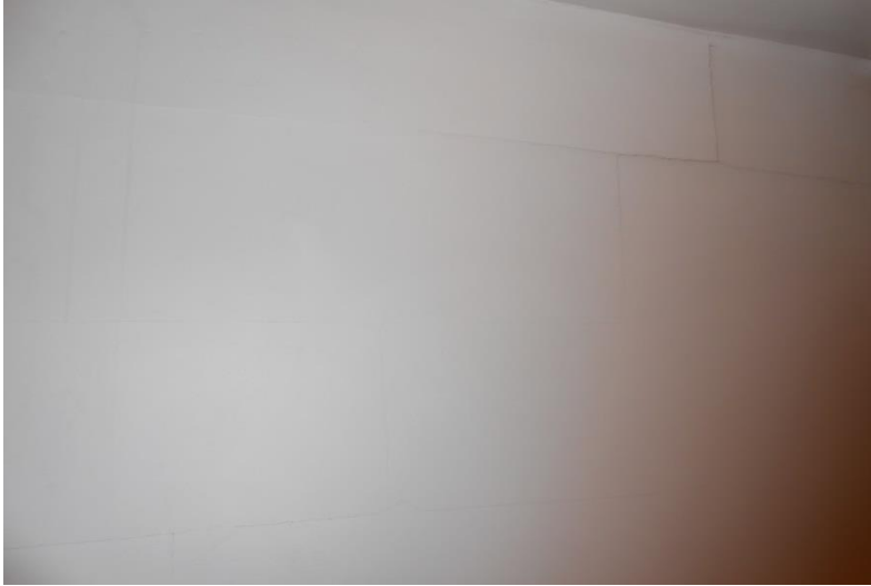
1621 Room - Female WC lobby - fracture at high level