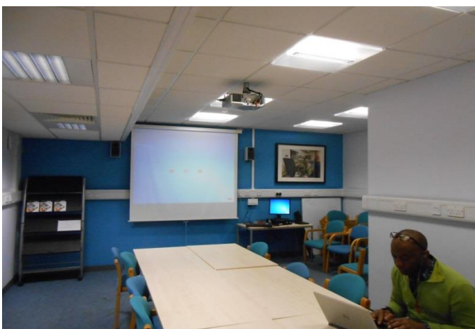
1633 Room 1.10