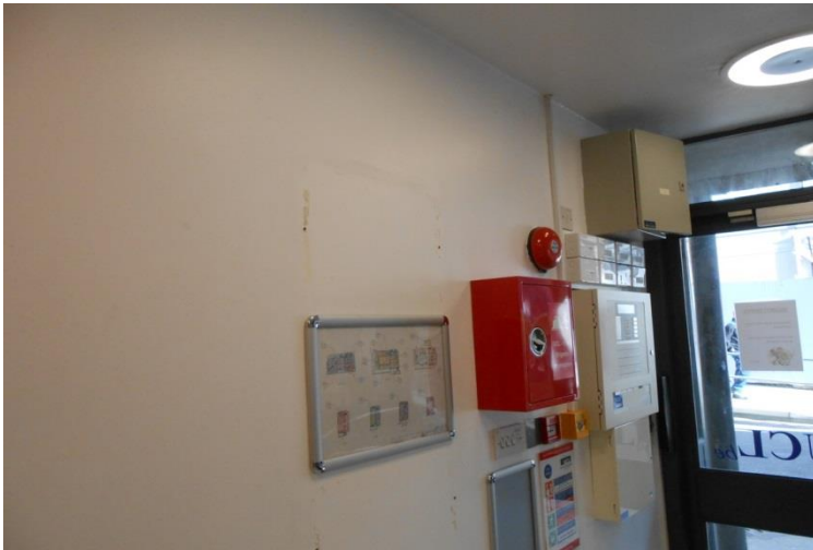
1565 Electrics within entrance Lobby 2.14