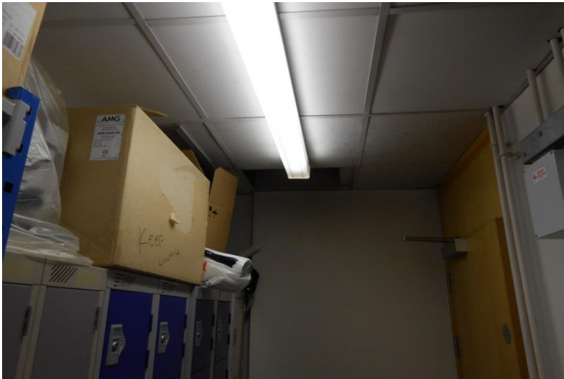
1567 locker room