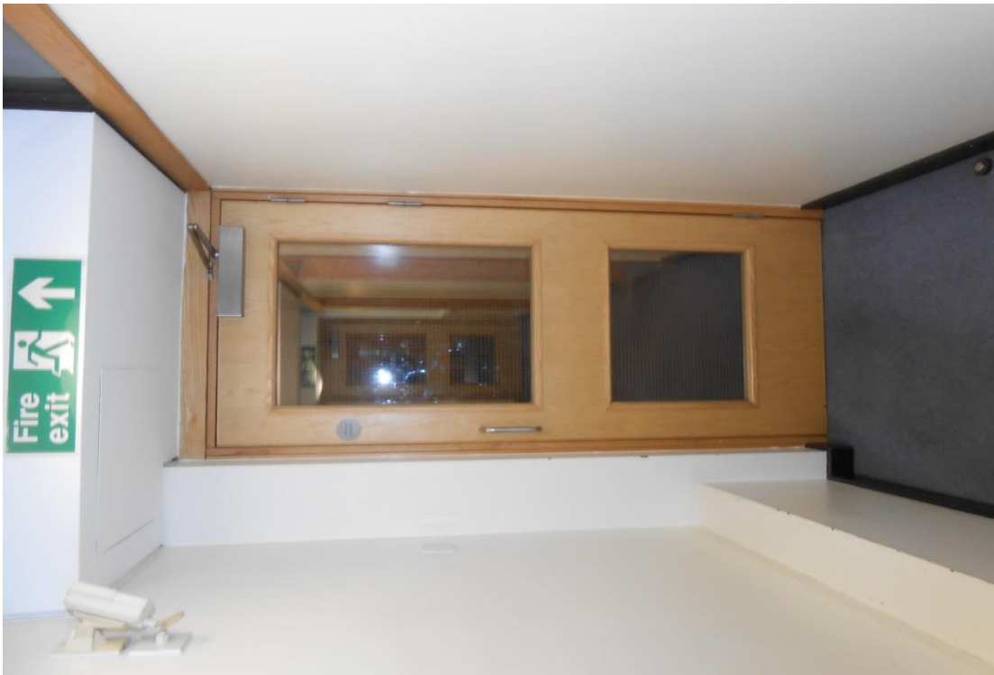
1731 Corridor 2.33