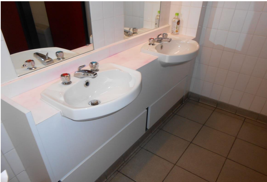
1623 Female WC