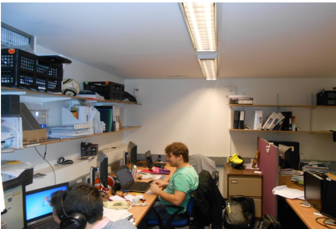
1684 Room 2.1