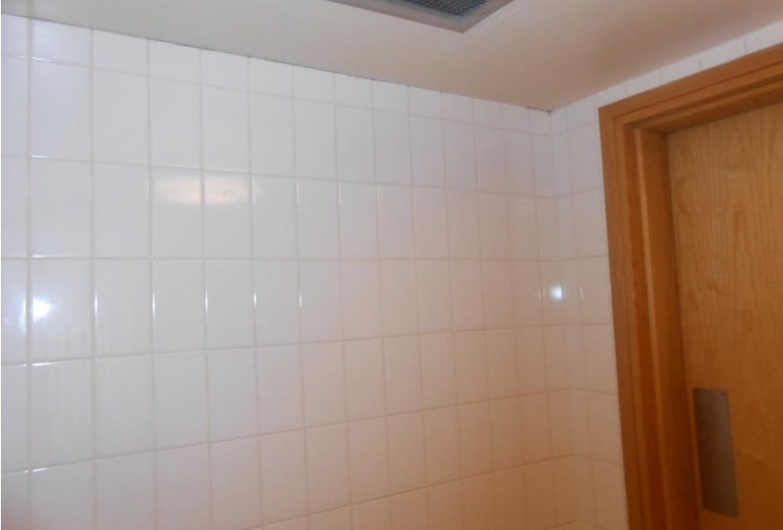
1755 Room 1.23