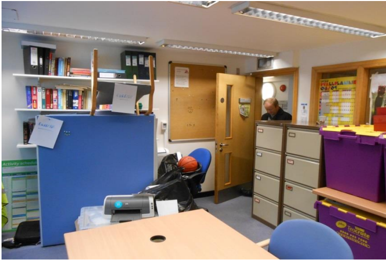
1704 Room 2.4