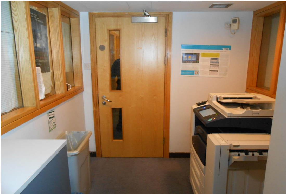
1669 Room 2.3