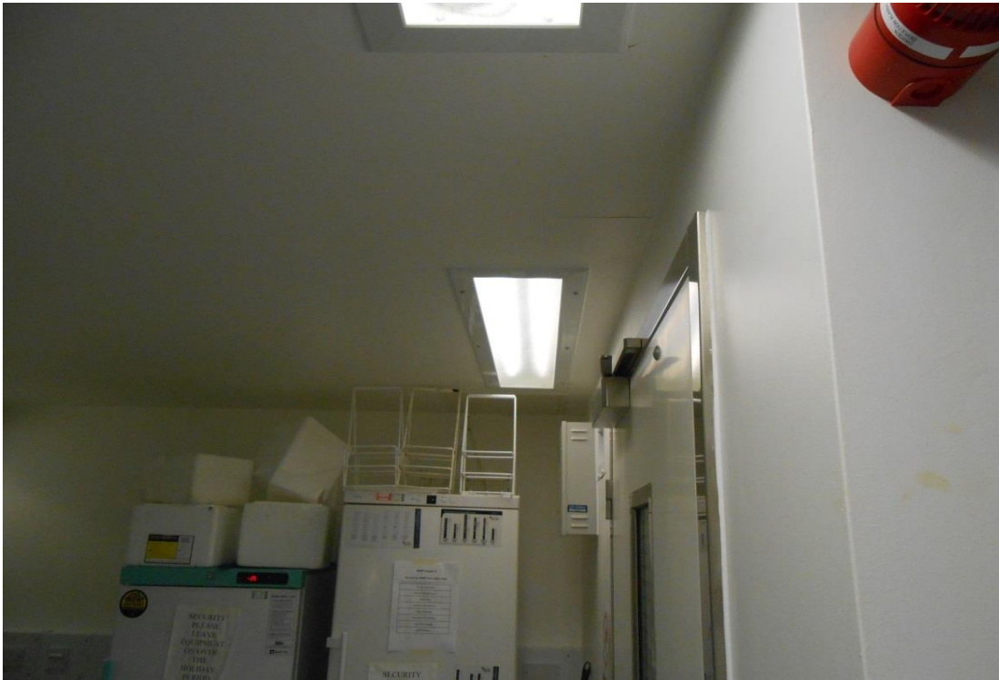
1649 Room 1.7B