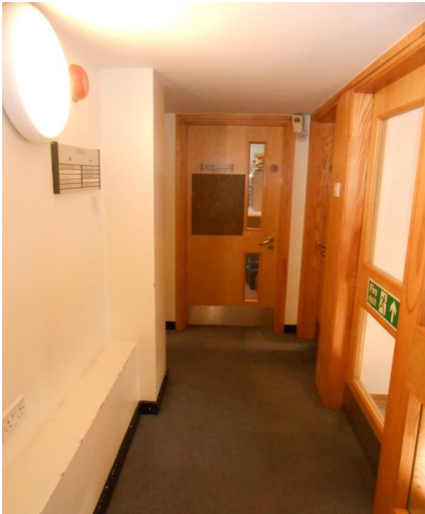
1710 Corridor 2.33