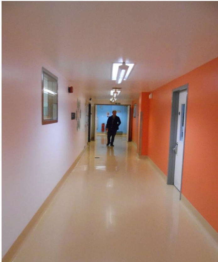
1631 Corridor 1.35