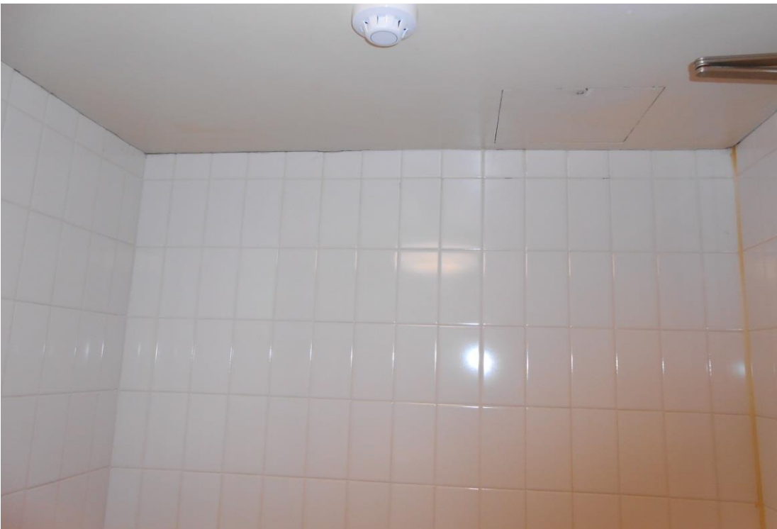
1756 Room 1.23