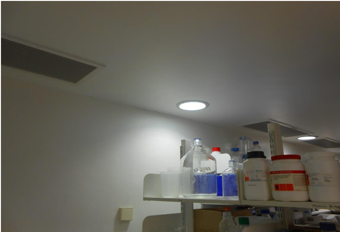
1673 Room 1.7A