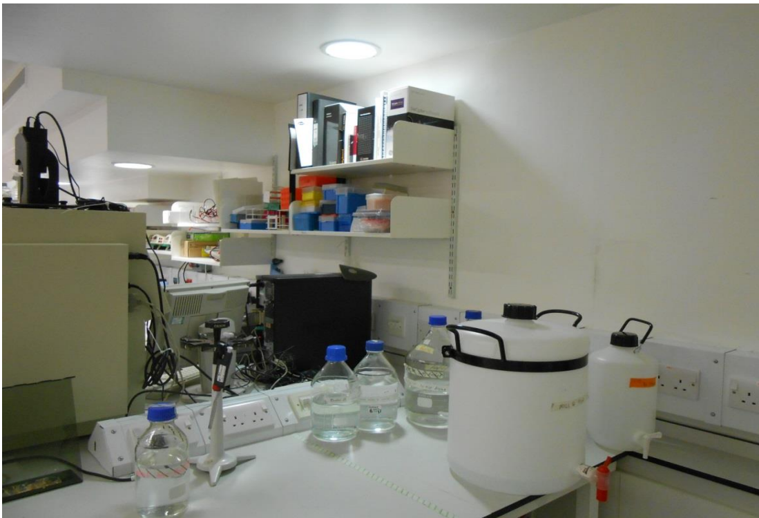
1646 Room 1.7B