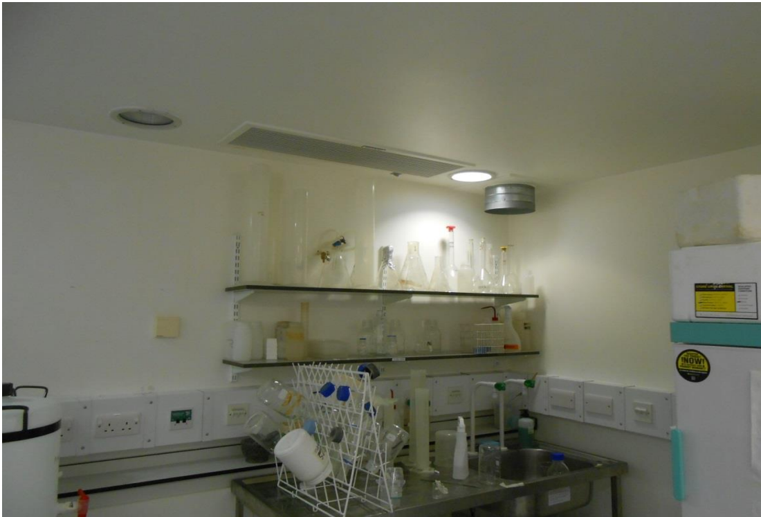
1644 Room 1.7B