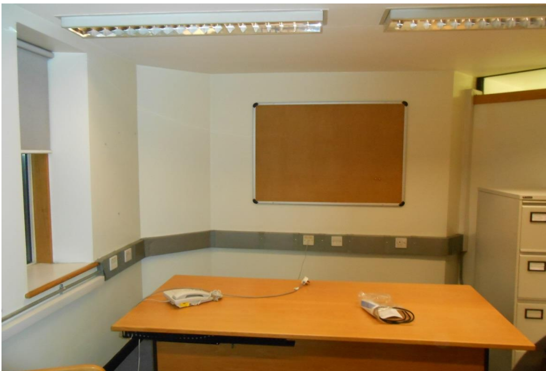
1739 Room 2.9