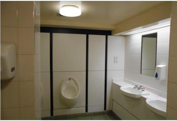
1758 Room 1.23