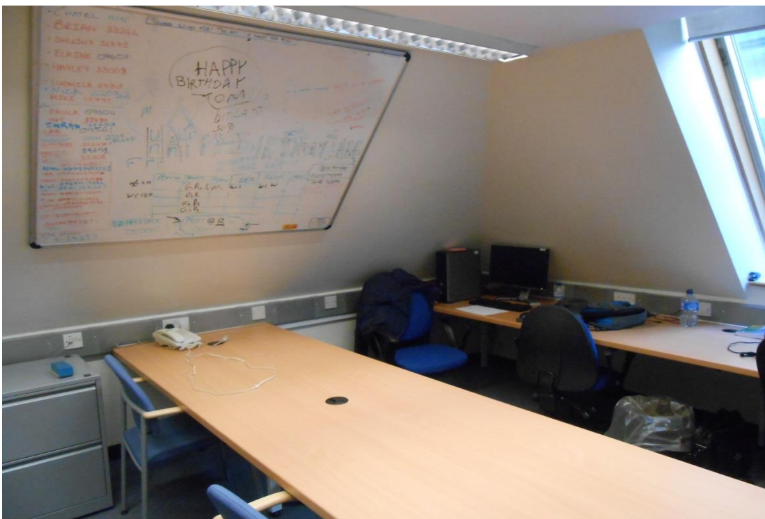
1702 Room 2.4