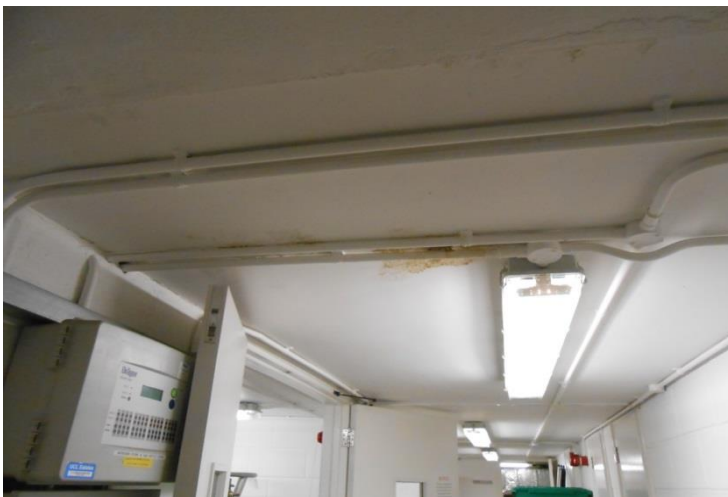
1573 Corridor to rooms 2.10 - 2.12B