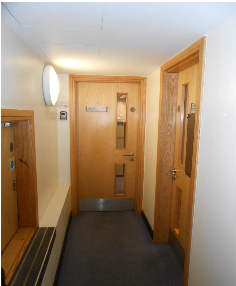
1709 Corridor - 2.33