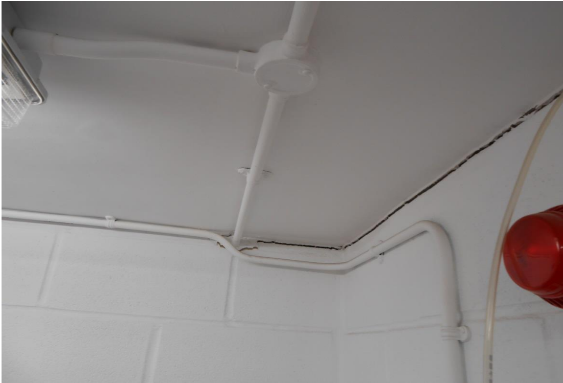
1577 Fracture - at high level which runs from Room 2.10 - 2.12A