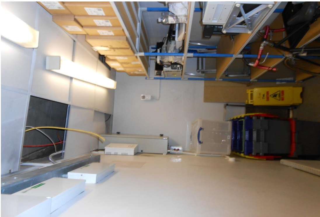
1566 Locker Room