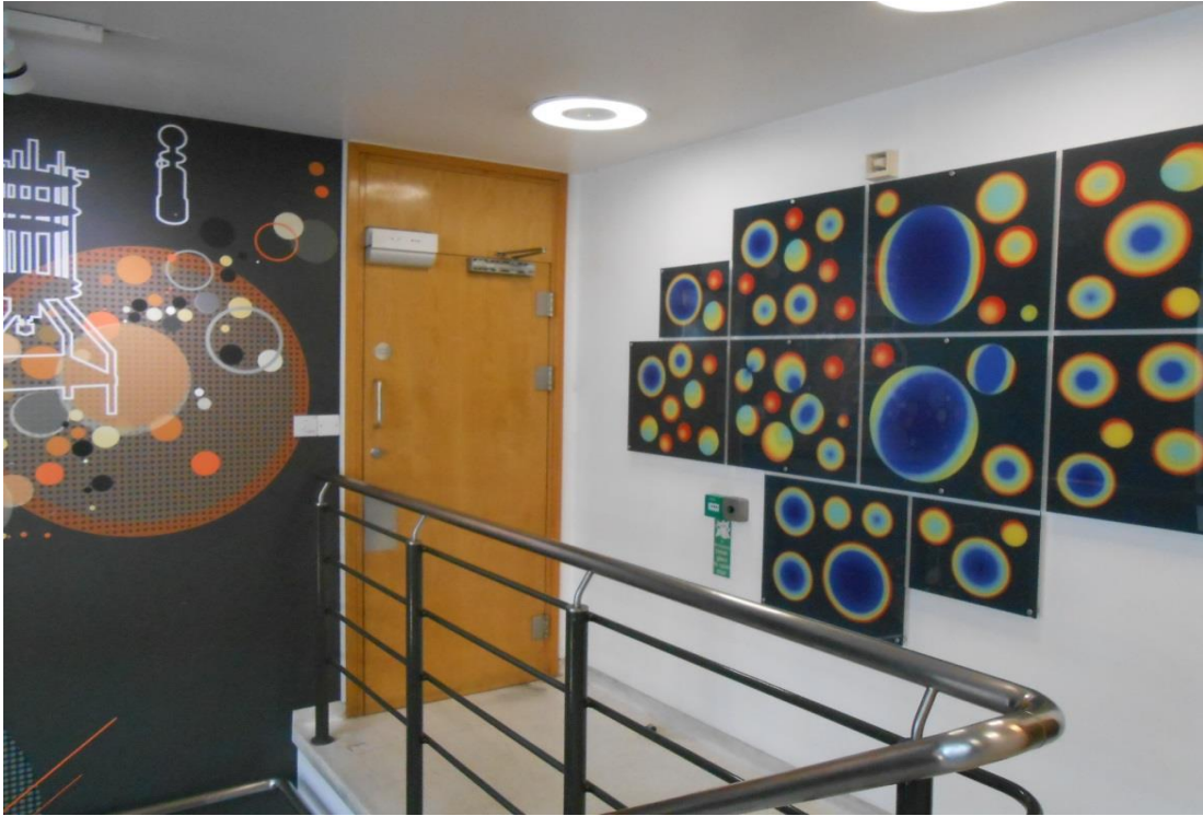
1563 ACBE Lobby