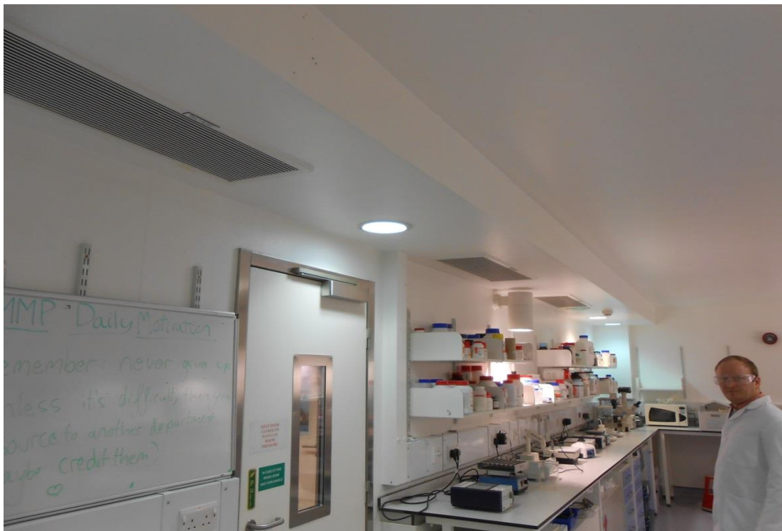
1652 Room 1.7B