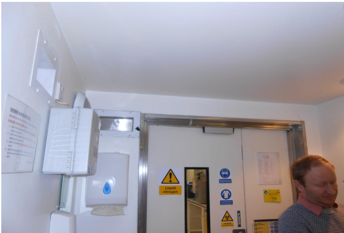
1643 Room 1.7 Lobby