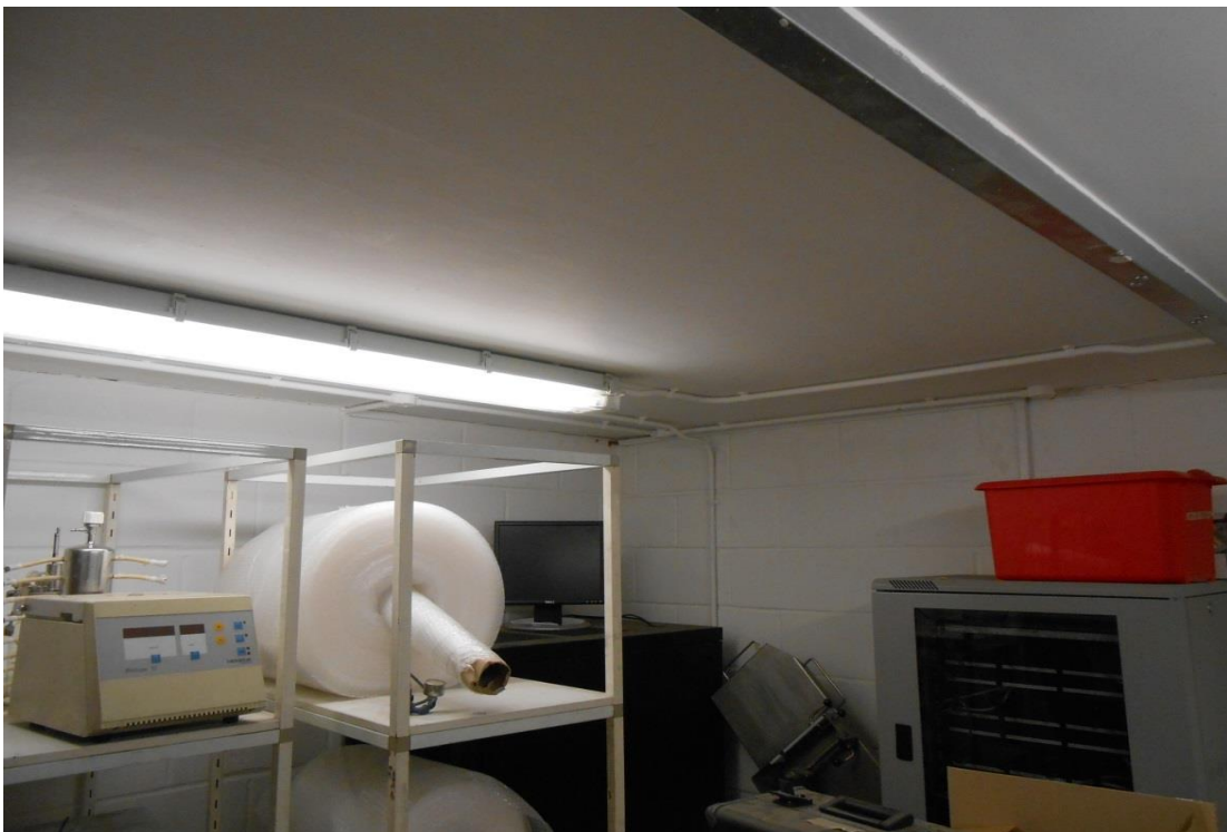
1583 Room 2.12 Store