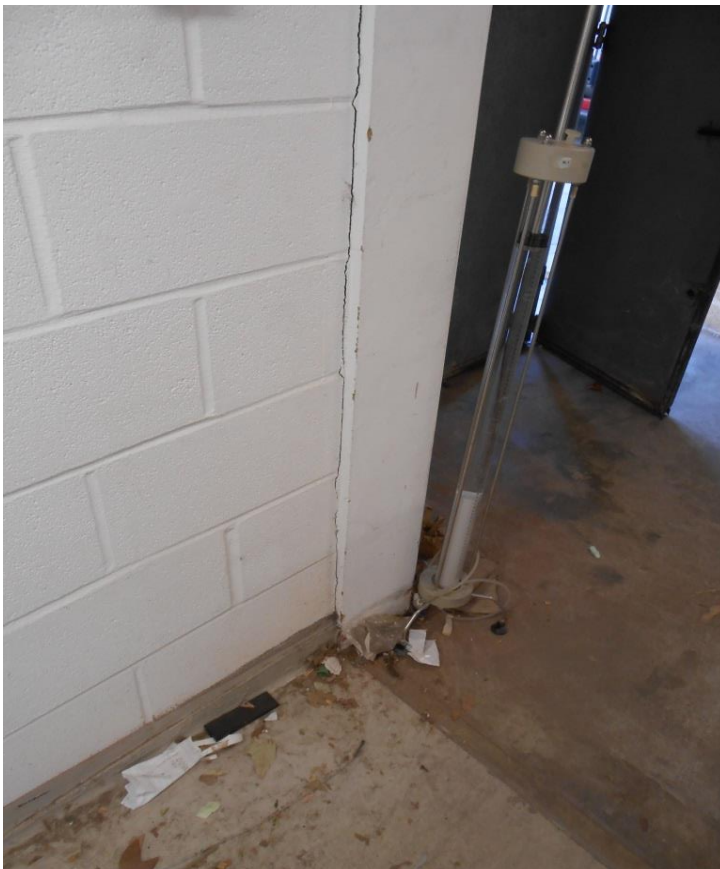
1589 Fracture to external elevation by external door leading to Access by Hoist Room 2.12B