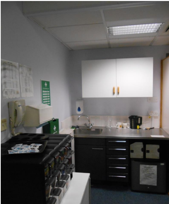
1634 Room 1.10