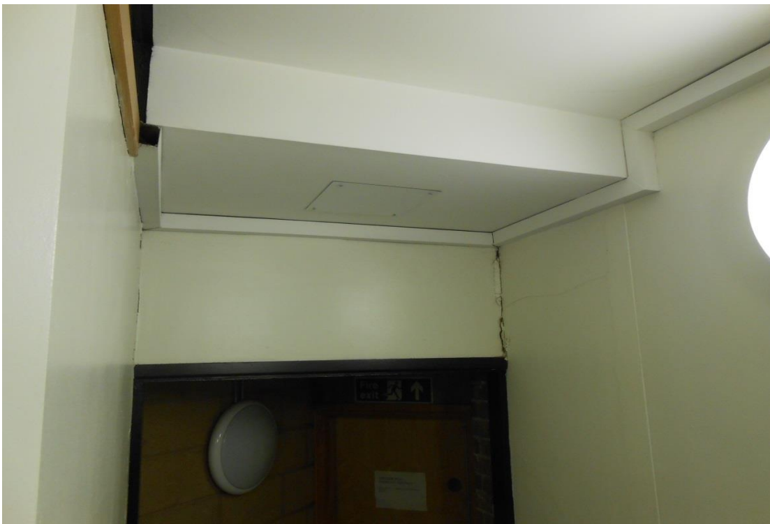
1745 Link corridor off Corridor 2.33