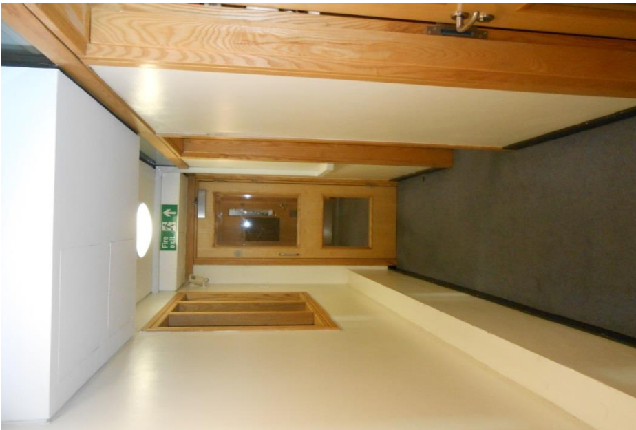
1722 Corridor 2.33