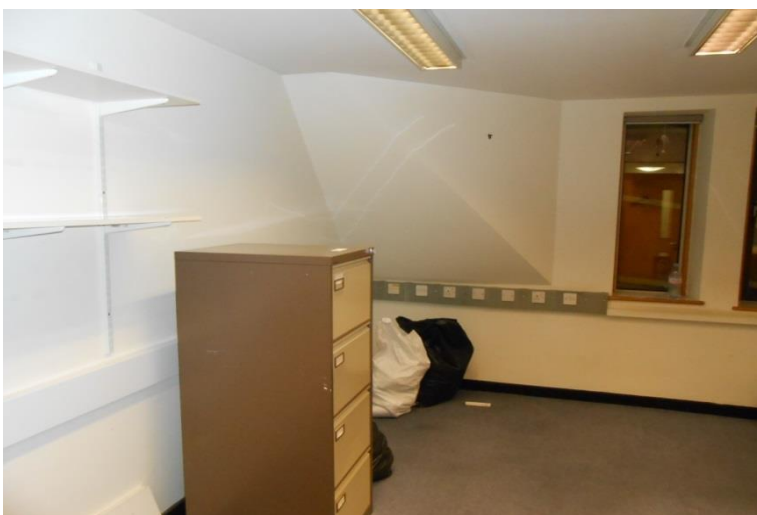
1727 Room 2.7