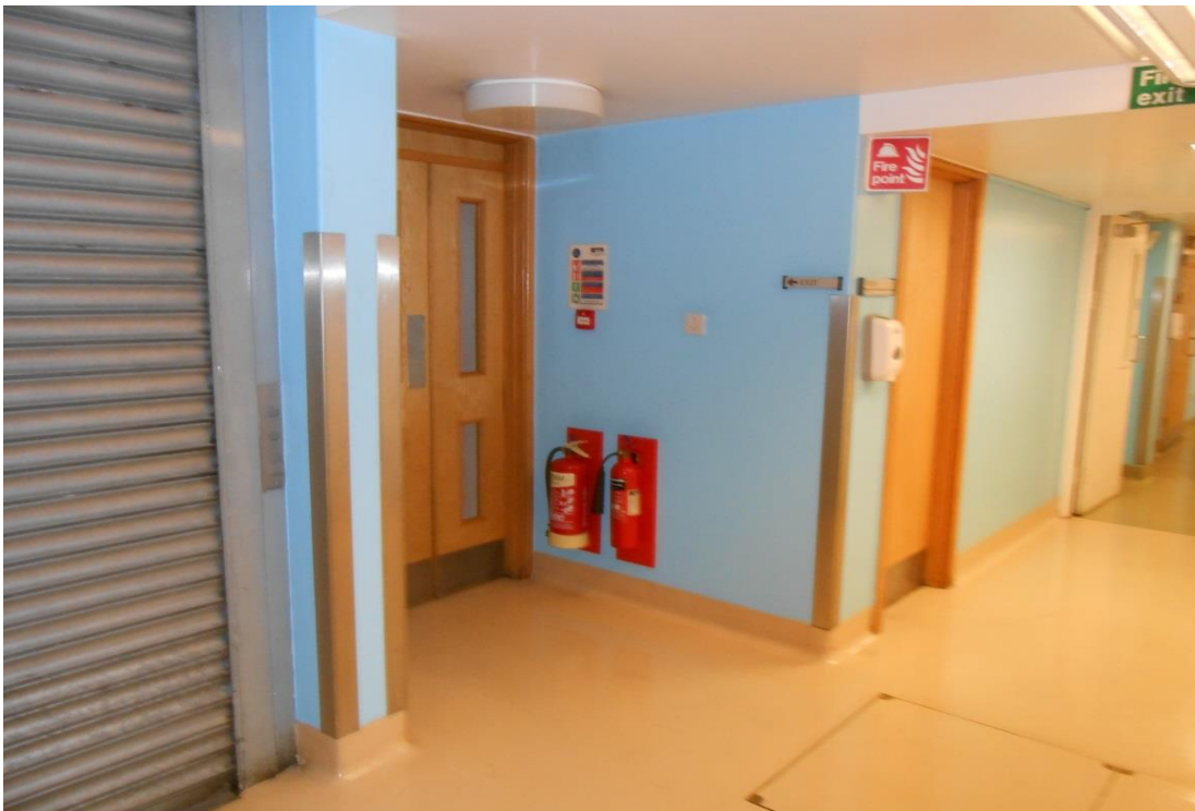
1616 Corridor 1.36 looking towards hoist/ WC