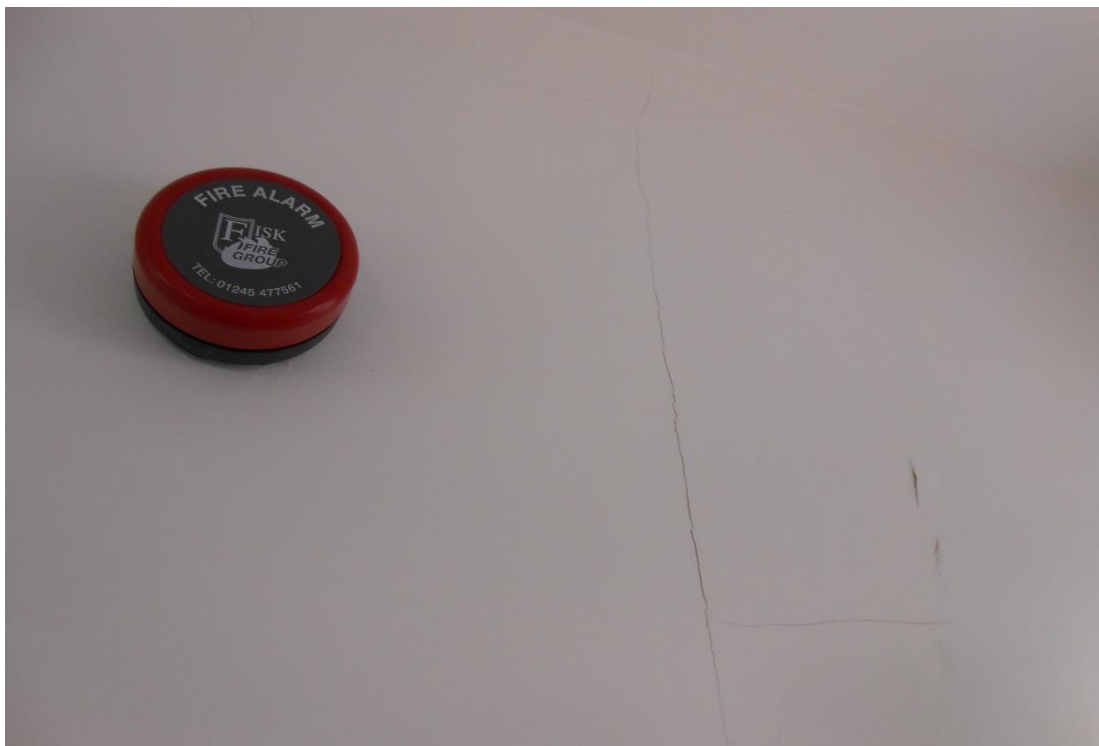
1661 Room 1.7B - Fracture at high level to corner on external elevation