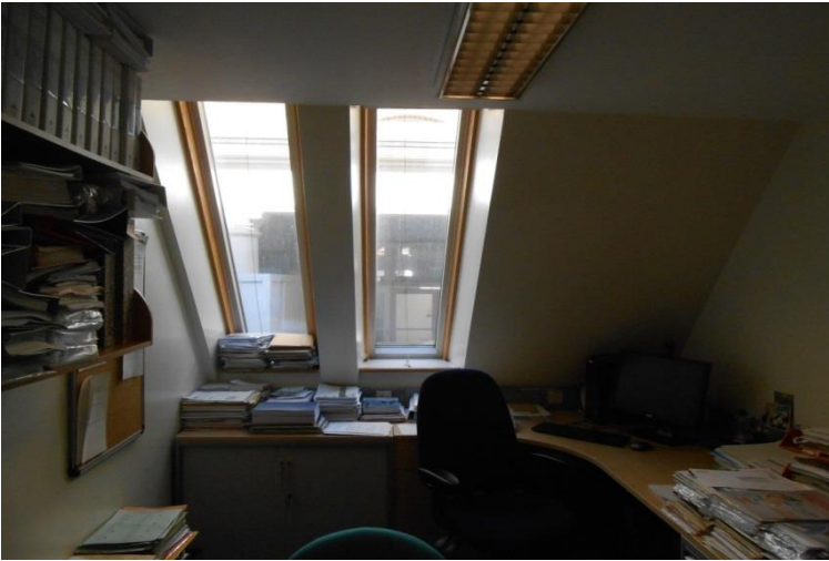
1717 Room 2.6