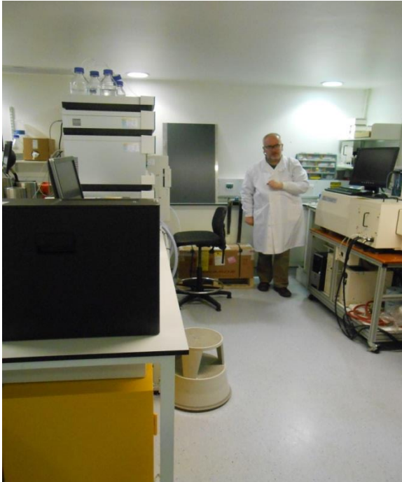
1681 Room 1.7A