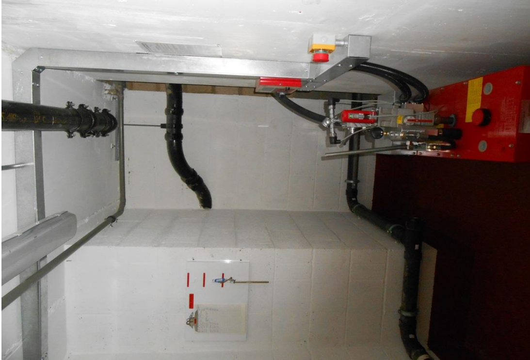
1768 Hoist Plant Room