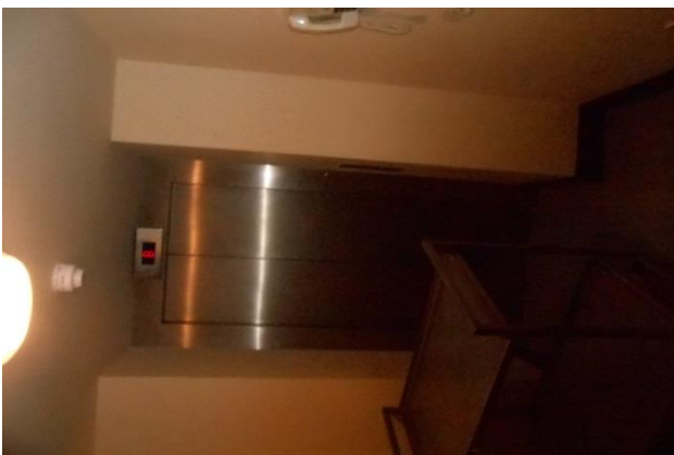
1765 Room with hoist