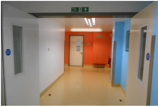
1629 Looking into Corridor (1.35)