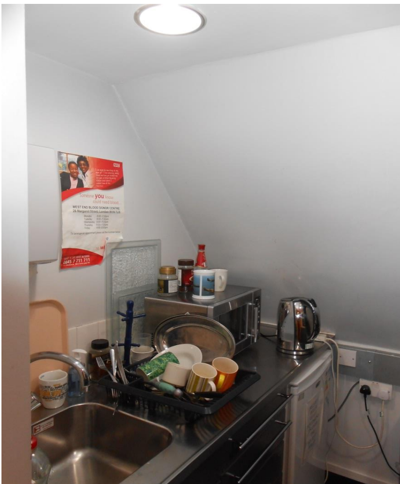
1697 Room 2.3