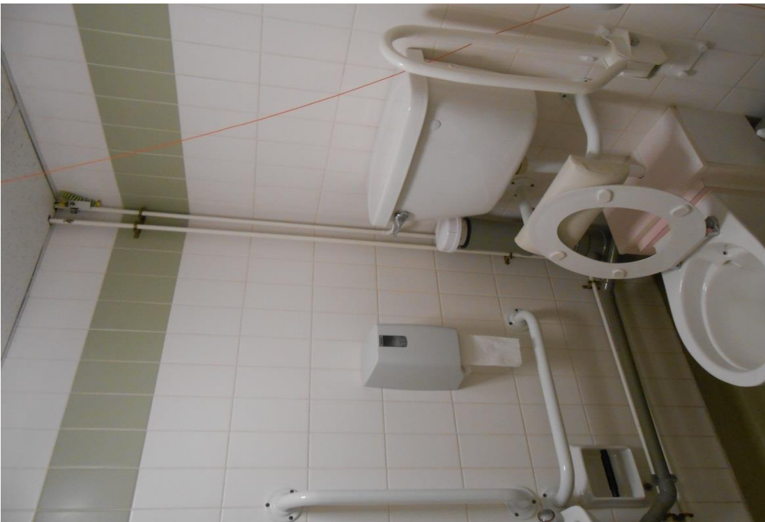
1762 Room 1.24