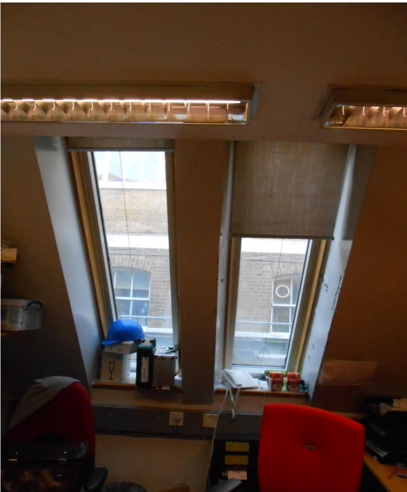
1690 Room 2.2