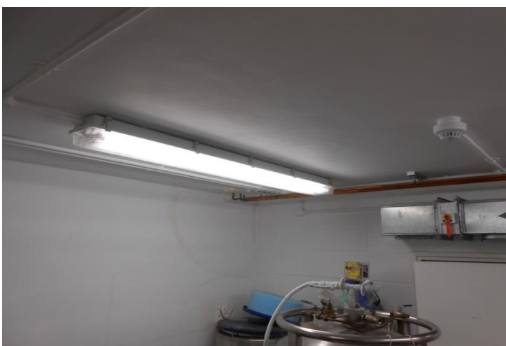
1575 1.12A Nitrogen Store