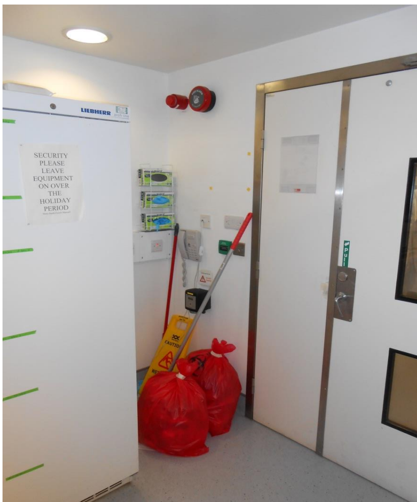
1668 Room 1.7A