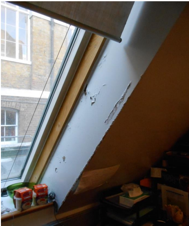
1692 Room 2.2