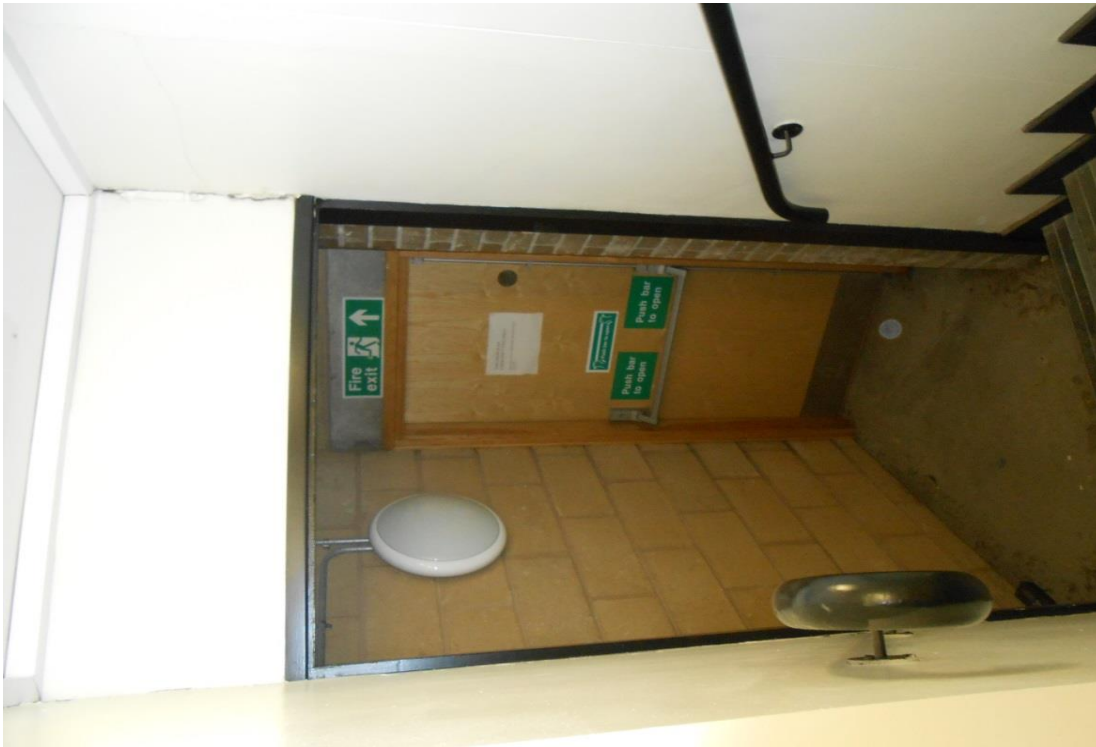
1744 Link corridor off Corridor 2.33