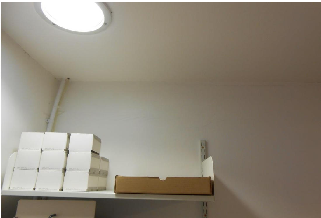
1678 Room 1.7A fracture at high level