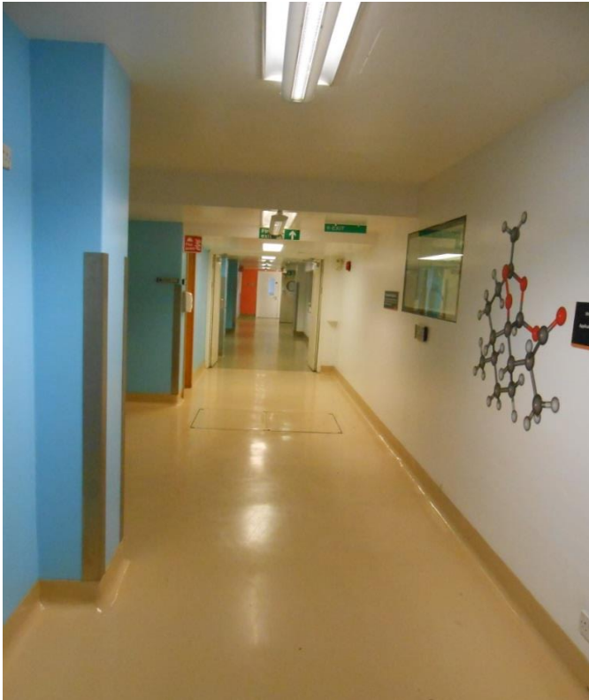
1615 Corridor 1.36