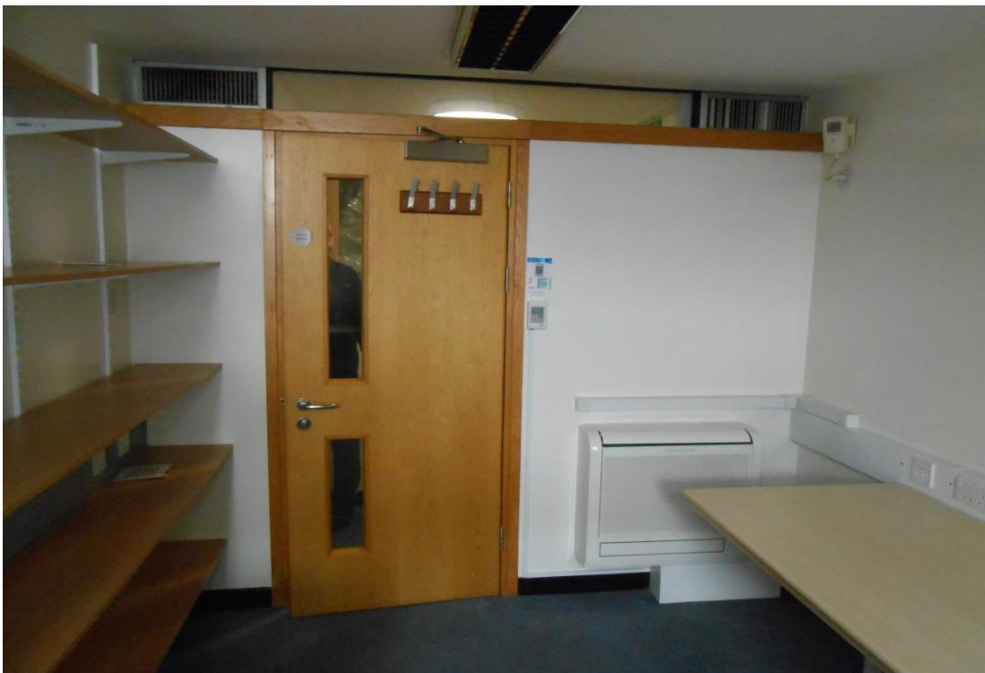
1713 Room 2.5