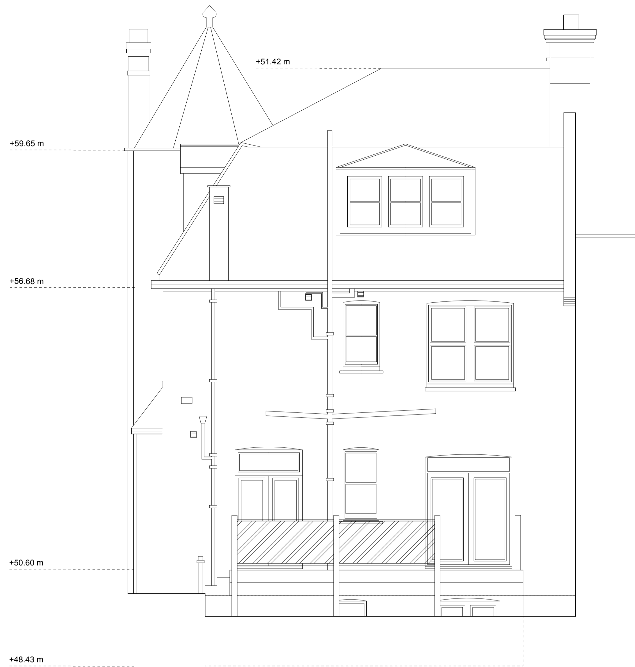
1 Rear elevation existing Scale: 1:50