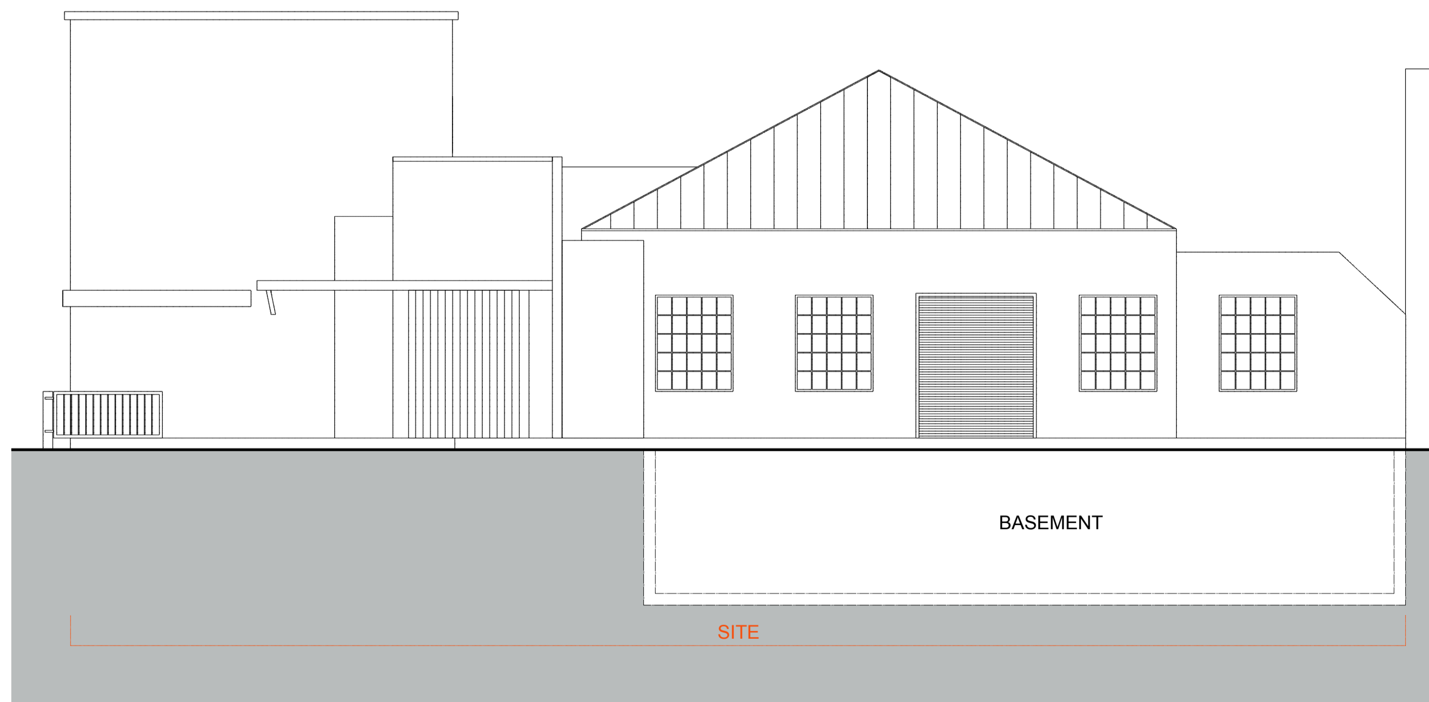
West Facing Elevation - Existing Cobourgh Street