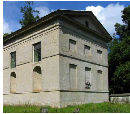
St Andrew's Church, Robert Adam, 1769

Further to exploring the ideas of niches and recesses, brick has been considered the most appropriate material choice given the conservation Area context and existing building. We have explored the use of a 2 inch brick (50mm), elegant in appearance and readily adopted within the rhythm and proportions of the façade. Bricks can also be used and adapted to suit the recessed approach, helping to break the unrelieved uniformity of the façade, as can be seen in the various Georgian examples. As a result the elevations would vary according to light conditions and the angle of view, ensuring the building maintains a tactile and sculptural quality rather than an unrelieved uniformity. The colour of brickwork is also an important consideration and is closely informed by the neighbouring buildings, we propose the use of yellow facing brick and envisage that the north elevation is stripped of its current white paintwork.