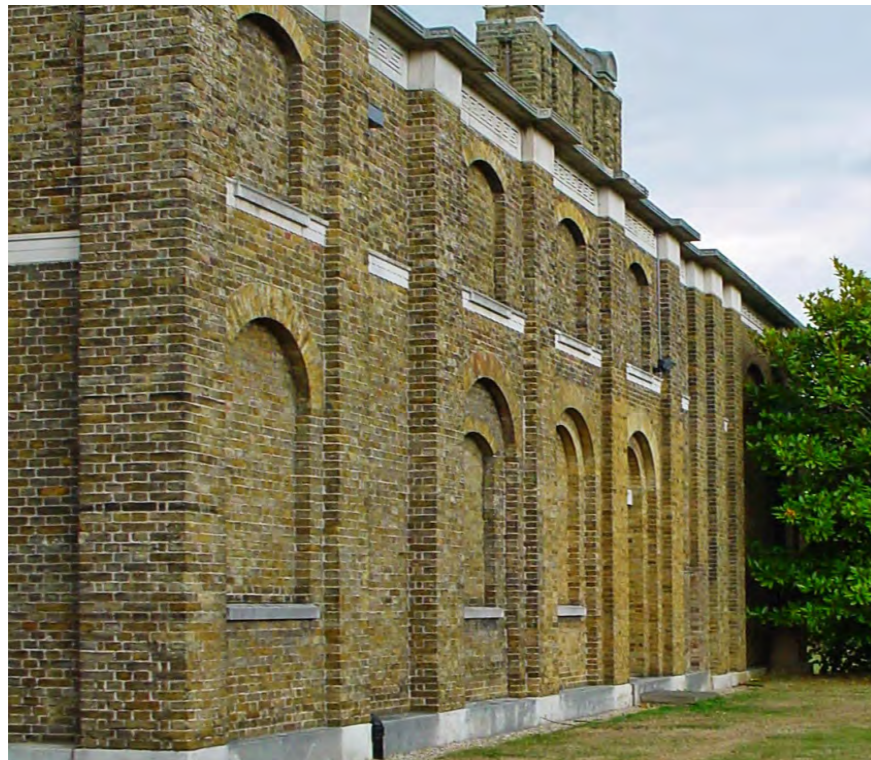
The Dulwich Picture Gallery, Sir John Soane, 1817