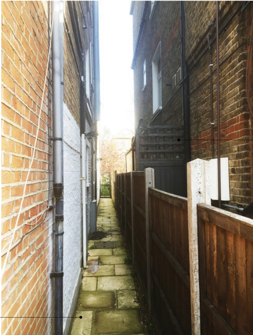
No. 74 Canfield Gardens