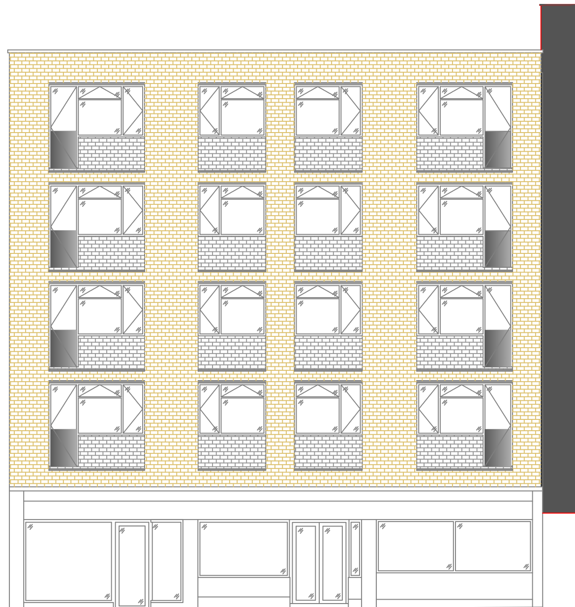
WEST ELEVATION - FRONT