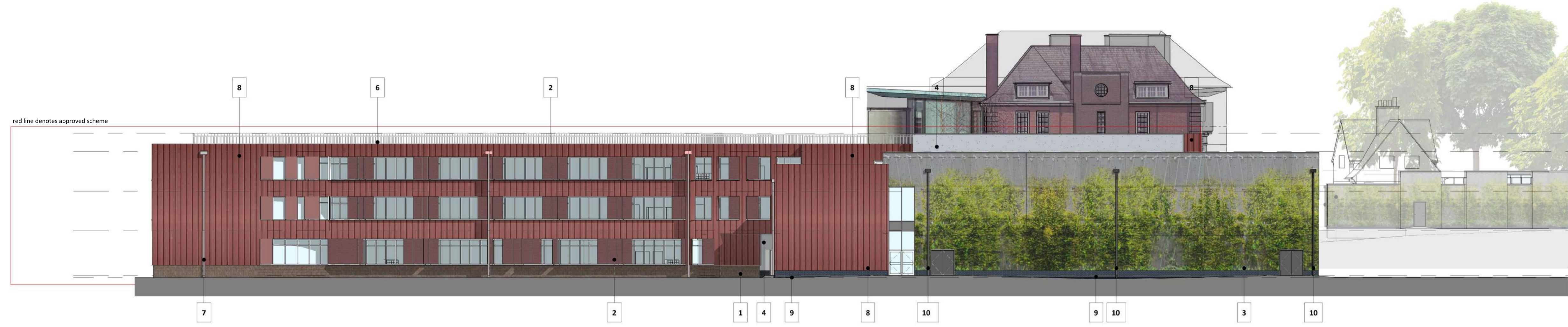
2. Proposed South-East Elevation SCALE - 1 : 200@A1

GSSarchitecture 35 HEADLANDS, KETTERING, NORTHANTS, NN15 7ES Telephone: 01536 513 165, Fax: 01536 410 226 Email: gss@gotch.co.uk, Web: www.gssarchitecture.com Gloucester: 01452 525 019, Harrogate: 01423 815 121