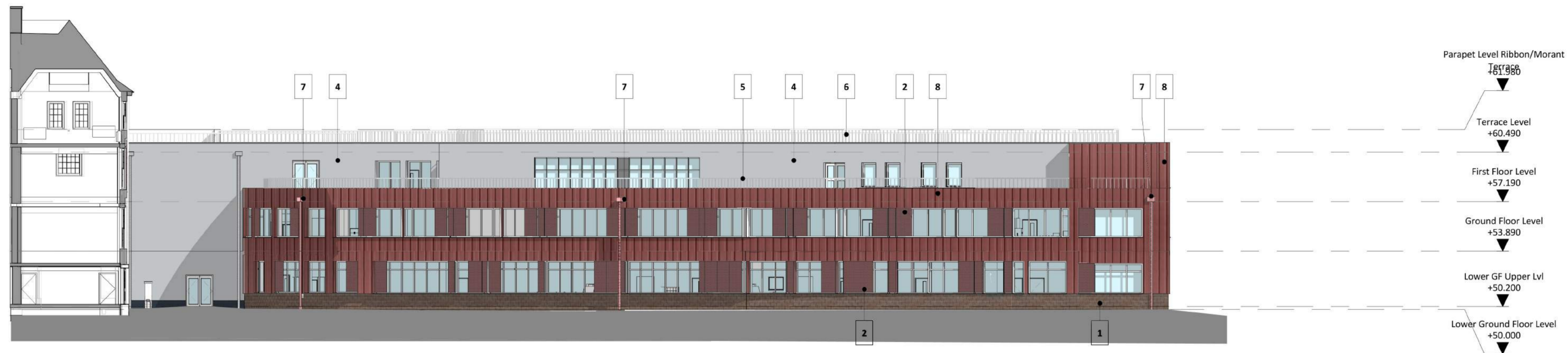
1. Proposed Ribbon Building North-West Elevation SCALE - 1 : 200@A1