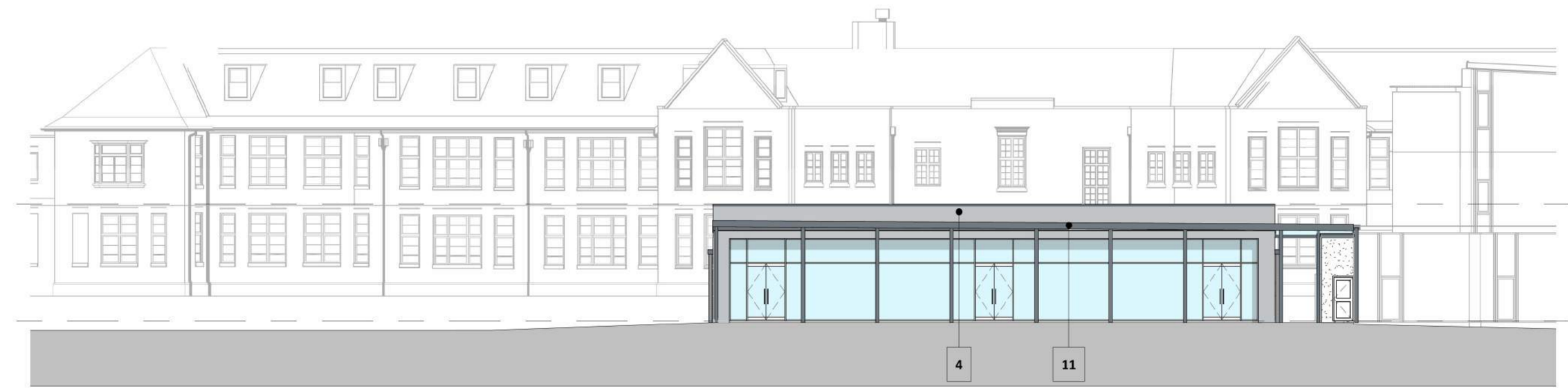
3. Proposed South East Elevation SCALE - 1 : 200@A1