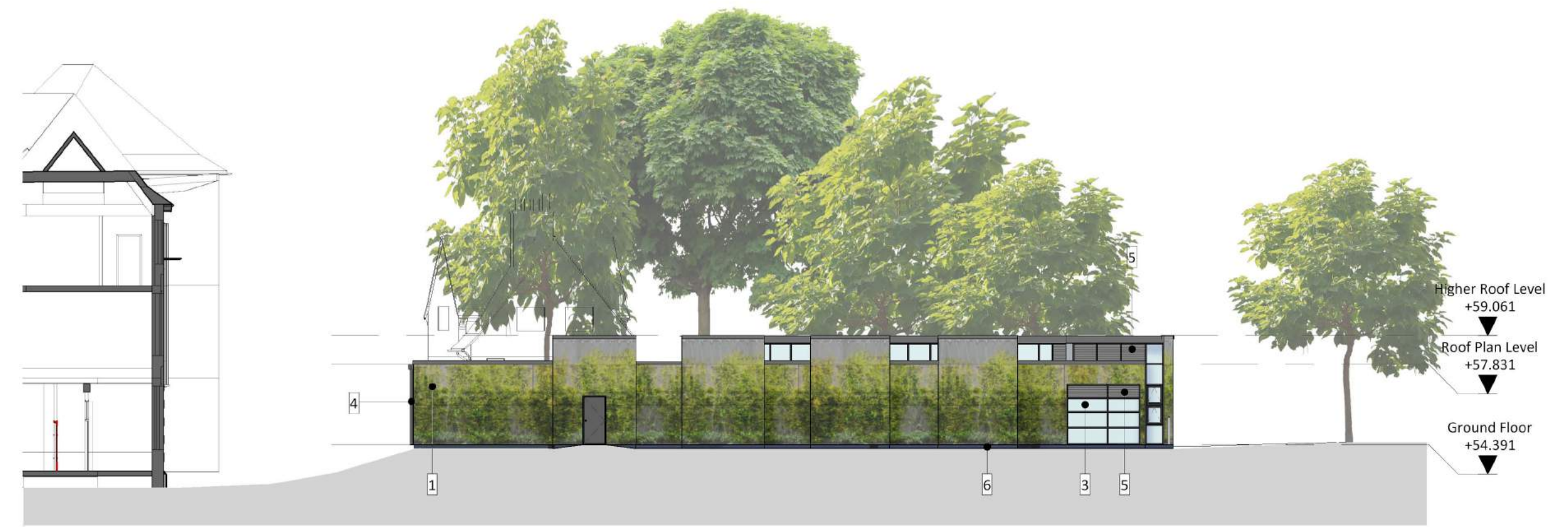
3. South-East Elevation SCALE - 1 : 200@A1