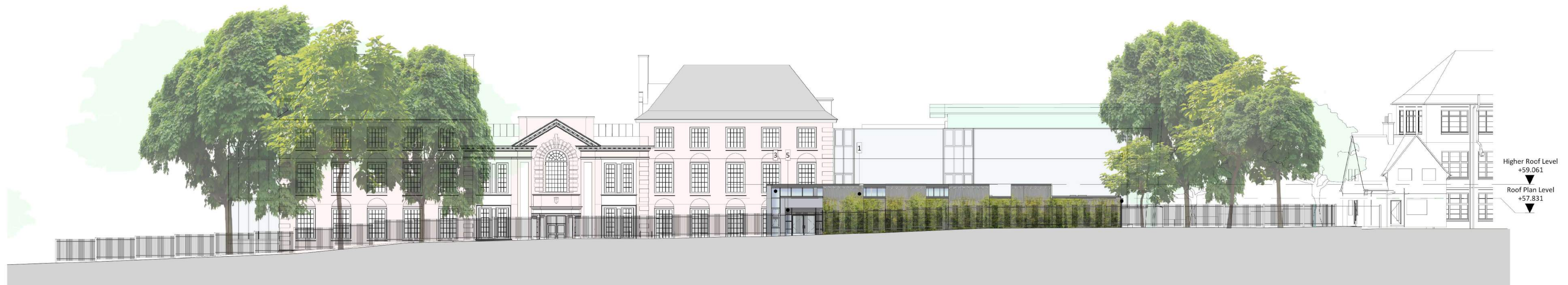
4. North-East Elevation SCALE - 1 : 200@A1