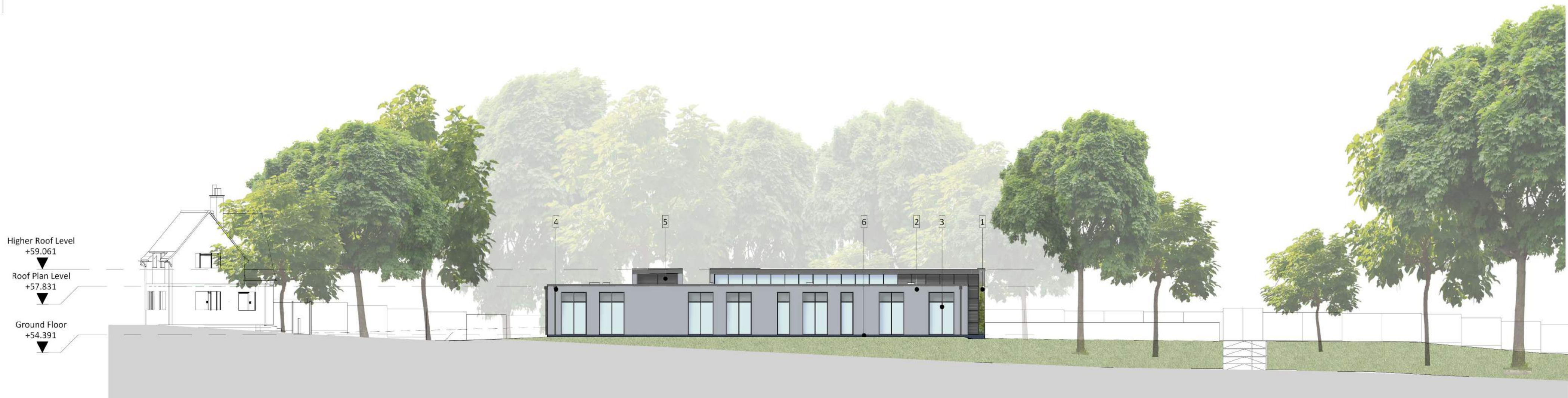
1. South-West Elevation SCALE - 1 : 200@A1