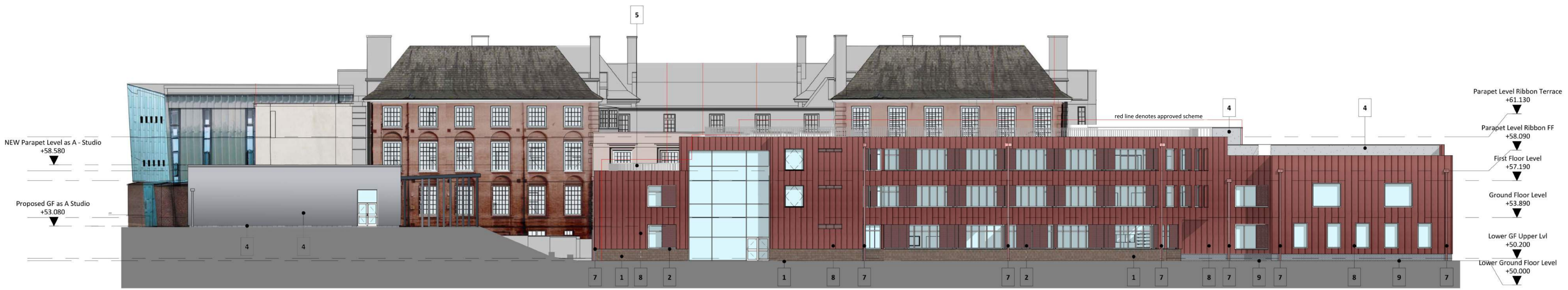
1. Proposed South-West Elevation SCALE - 1 : 200@A1