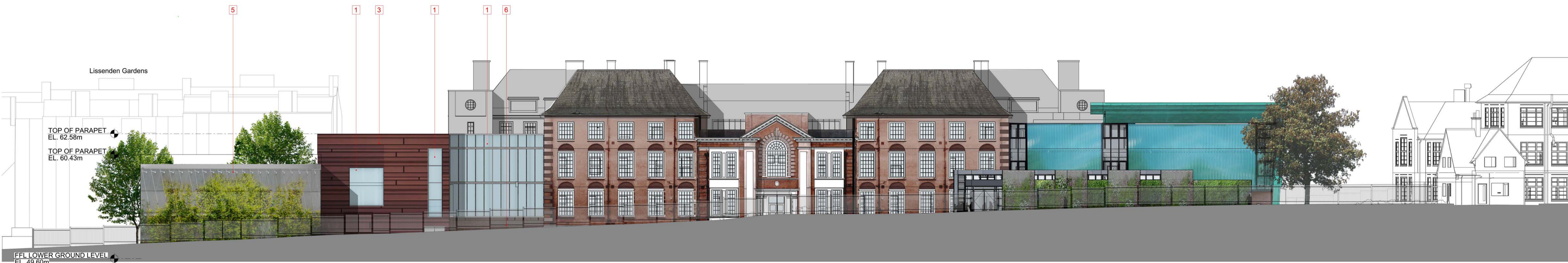
01 ELEVATION 1 - NORTHEAST 1:200