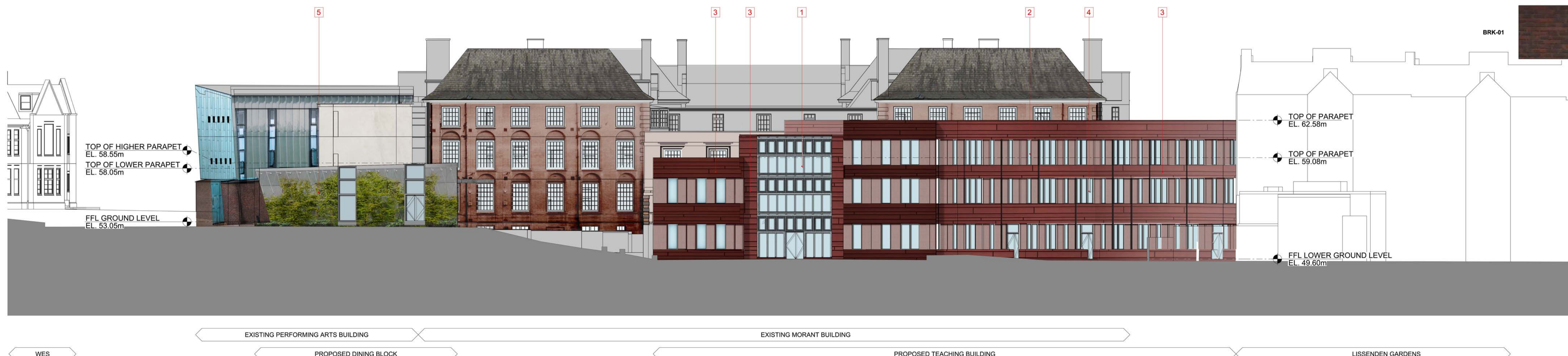
03 ELEVATION 2 - SOUTHWEST 1:200