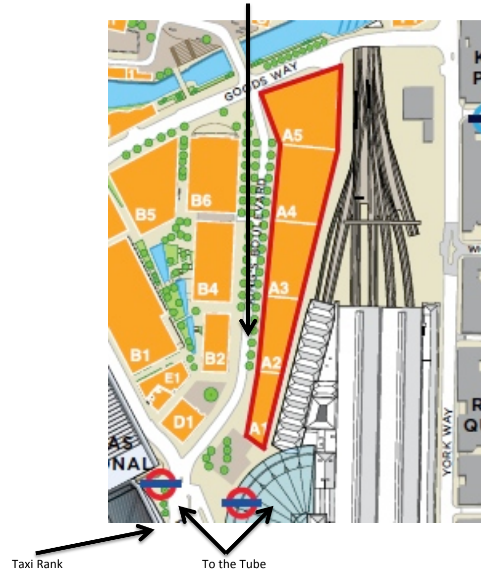
Audience entrance point to The King's Cross South Extension

All visitors will access the venue from King's Boulevard to the west of King's Cross station. No matter how they arrived at the venue (by tube, taxi, bus, private car or other means), all audience members will be able to easily find and access the temporary theatre site.