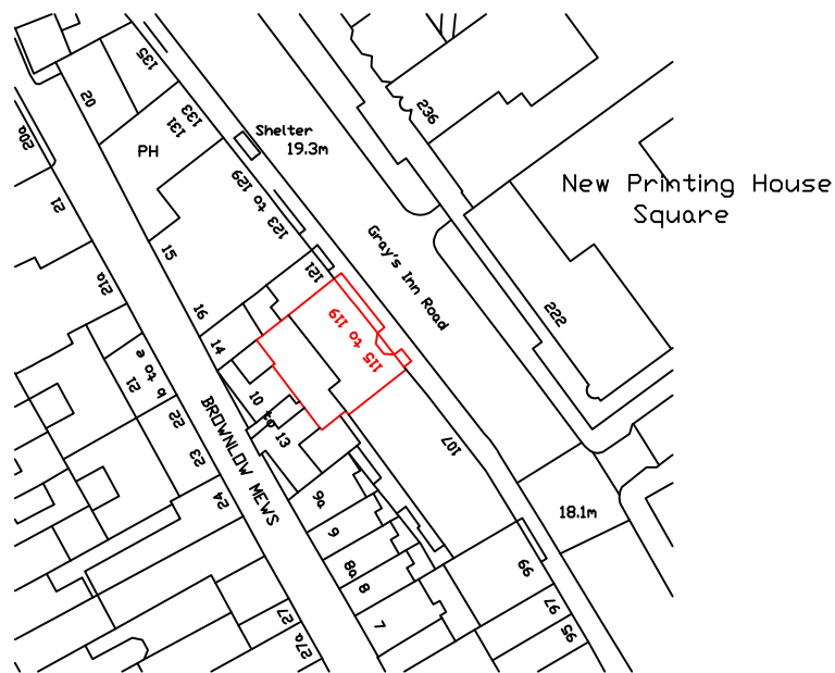
Location Plan (scale 1:1250)