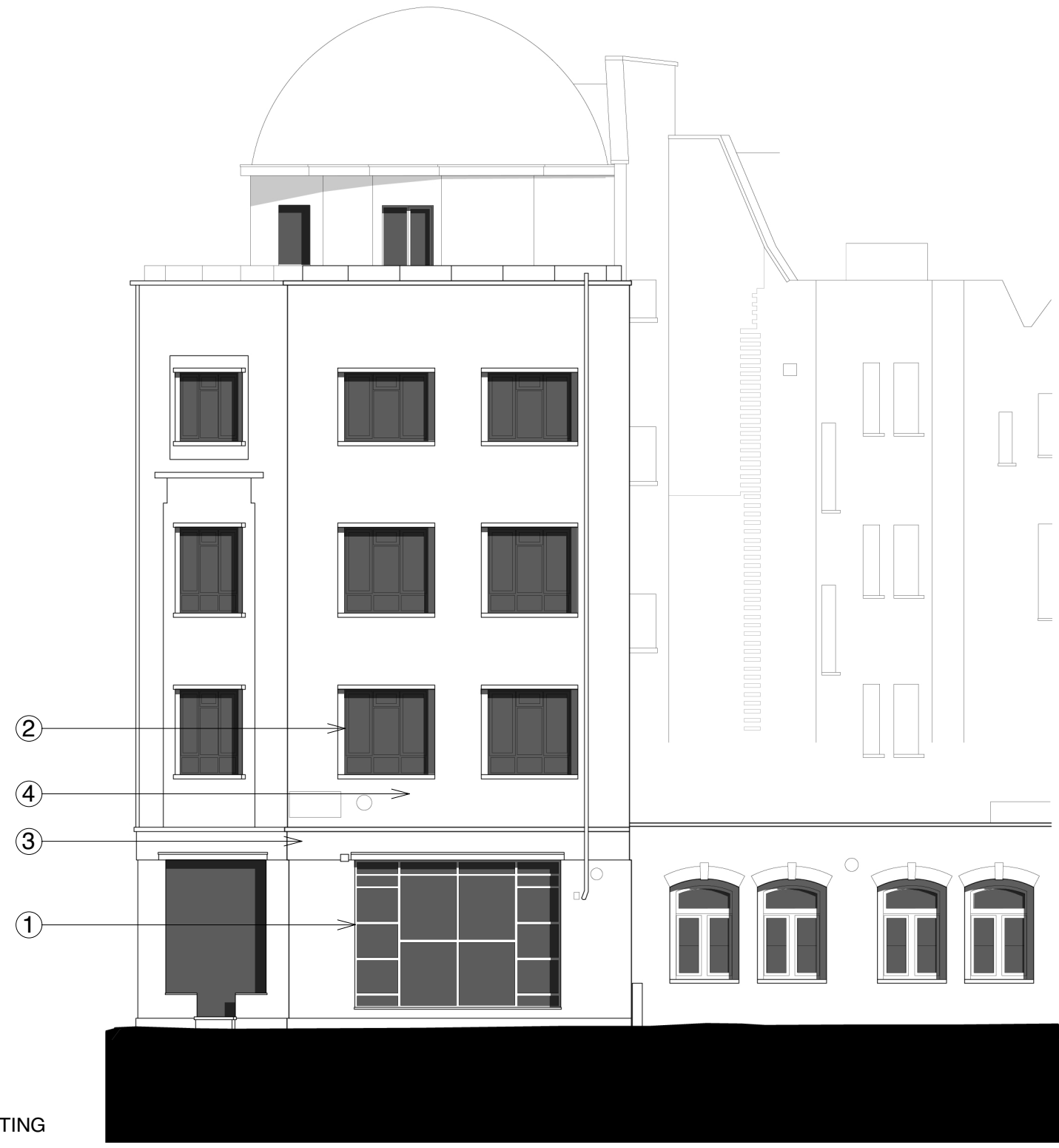
ELEVATION C: TOWER STREET AS EXISTING

NOTES: ALL WORK TO BE CARRIED OUT IN ACCORDANCE WITH THE BUILDING REGULATIONS 2010 AND SUBSEQUENT AMENDMENTS AND TO THE SATISFACTION OF THE BUILDING CONTROL OFFICER OR APPROVED INSPECTOR. ALL WORK TO BE CARRIED OUT IN A PROFESSIONAL AND WORKMANLIKE MANNER IN ACCORDANCE WITH ALL RELEVANT CODES OF PRACTICE INCLUDING THE BRITISH STANDARDS. MATERIALS USED TO BE THE BEST OF THEIR RESPECTIVE KIND AND FIT FOR PURPOSE. ALL MATERIALS TO BE USED AND FIXED STRICTLY IN ACCORDANCE WITH MANUFACTURER'S RECOMMENDATIONS. THE CONTRACTOR IS RESPONSIBLE FOR CHECKING ALL DIMENSIONS ON SITE PRIOR TO COMMENCEMENT AND NOTIFY THE ARCHITECT IMMEDIATELY OF ANY DISCREPANCY. IF IN DOUBT ASK. DO NOT SCALE FROM THIS DRAWING. USE FIGURED DIMENSIONS ONLY. THIS DRAWING IS TO BE READ IN CONJUNCTION WITH ALL OTHER CONTRACT DOCUMENTS INCLUDING DRAWINGS, SCHEDULES & SPECIFICATIONS AND INFORMATION PROVIDED BY OTHER CONSULTANTS AND SPECIALISTS. INCONSISTENCIES, ERRORS AND OMISSIONS FOUND WITHIN THESE DOCUMENTS ARE TO BE NOTIFIED IMMEDIATELY TO THE ARCHITECT. ALL DRAWINGS WITHIN THIS PACKAGE ARE THE COPYRIGHT OF MERRETT HOUMOLLER LTD. THEY MAY NOT BE COPIED OR DISCLOSED TO ANY THIRD PARTY FOR ANY PURPOSE EXCEPT AS AUTHORISED IN WRITING BY MERRETT HOUMOLLER LTD.