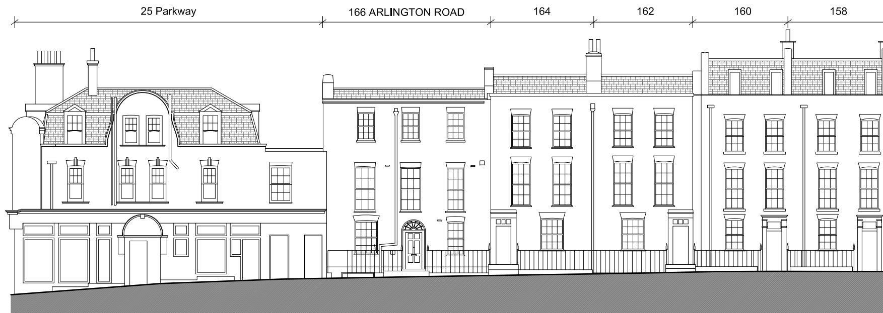
01 Arlington Road Elevation