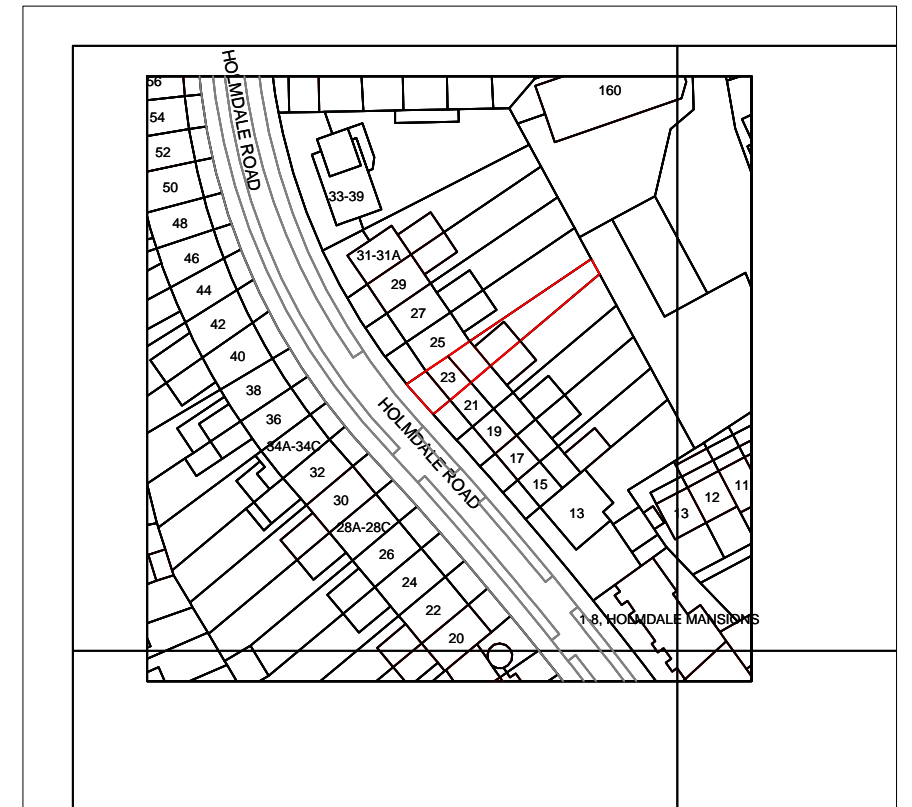
LOCATION PLAN Scale: 1:1250

NOTE: - All dimensions in this drawings are metric.