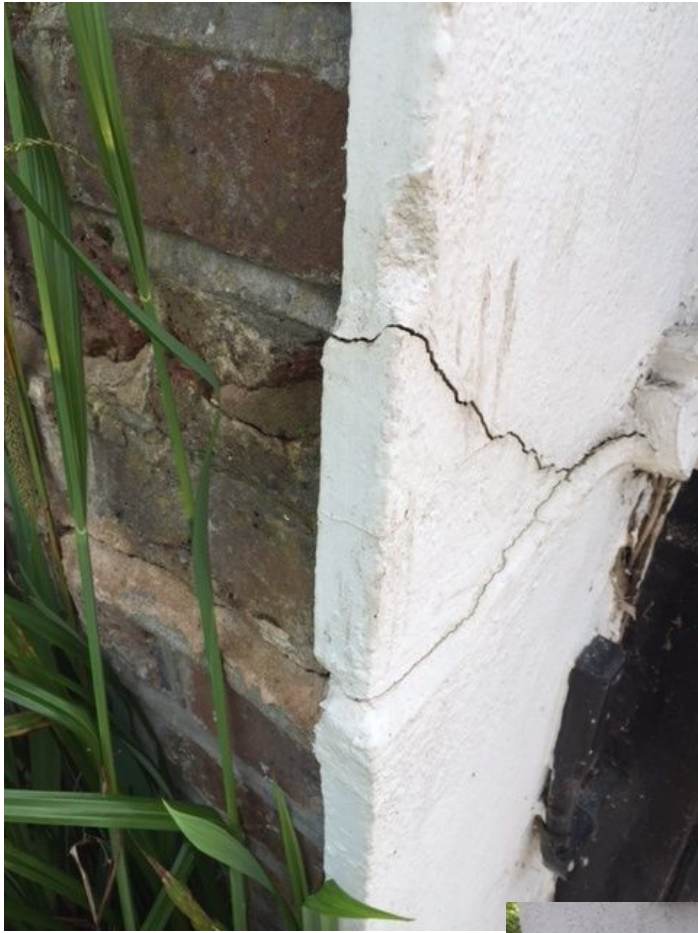
3) and 4) closer views of the cracking visible in photo 2.