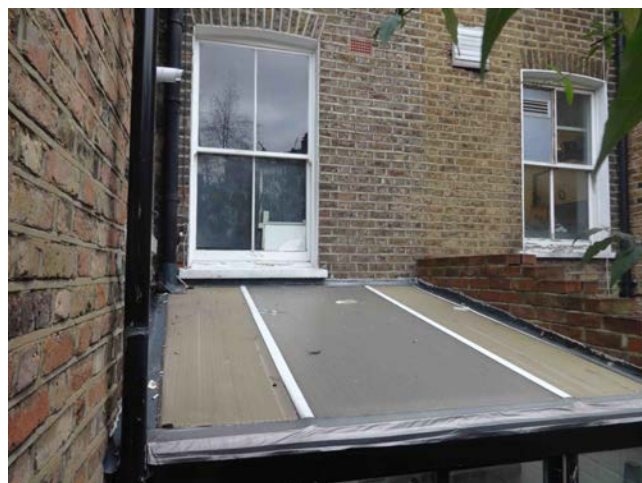
131B kitchen window (far left), 131B lounge window (middle), 129 kitchen window (right)