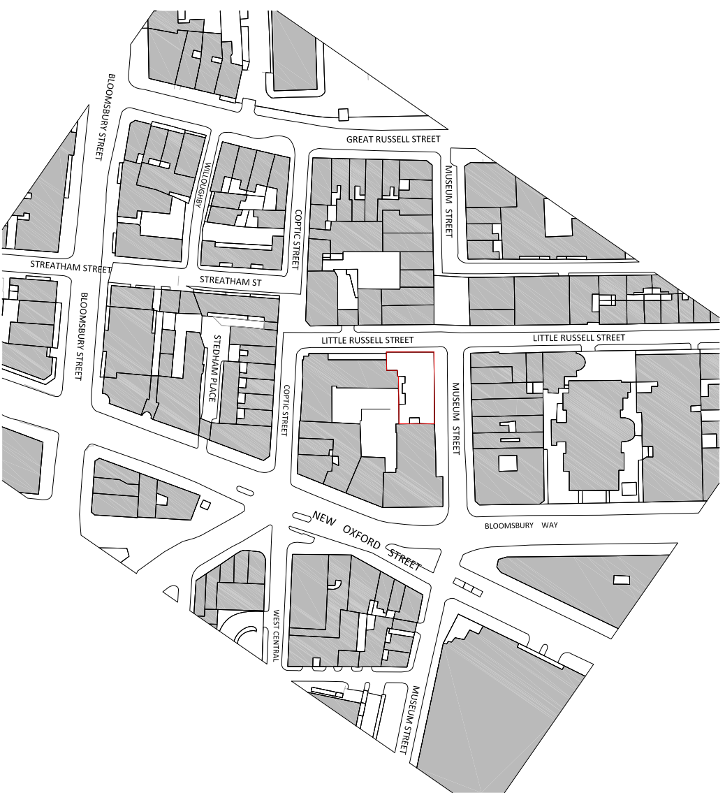
01 Location Plan (0:000) SCALE 1:1250