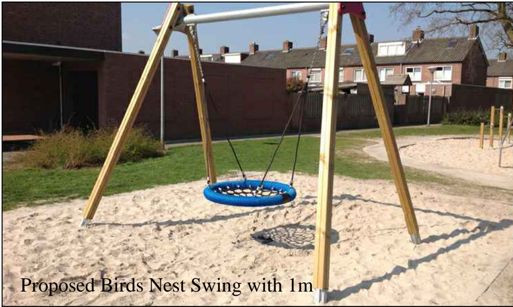
Proposed Birds Nest Swing with 1m