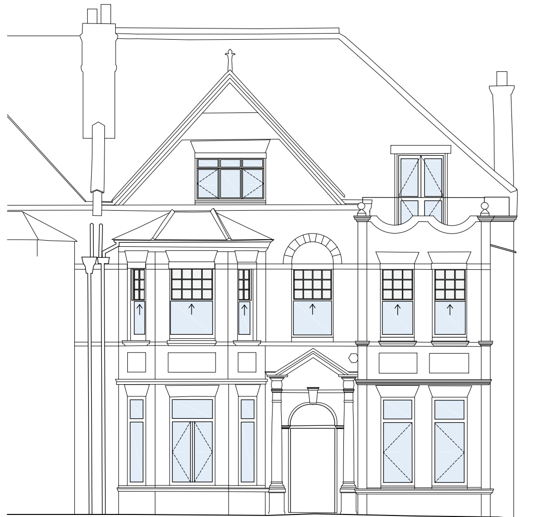
Existing Front Elevation (View from Lancaster Grove)