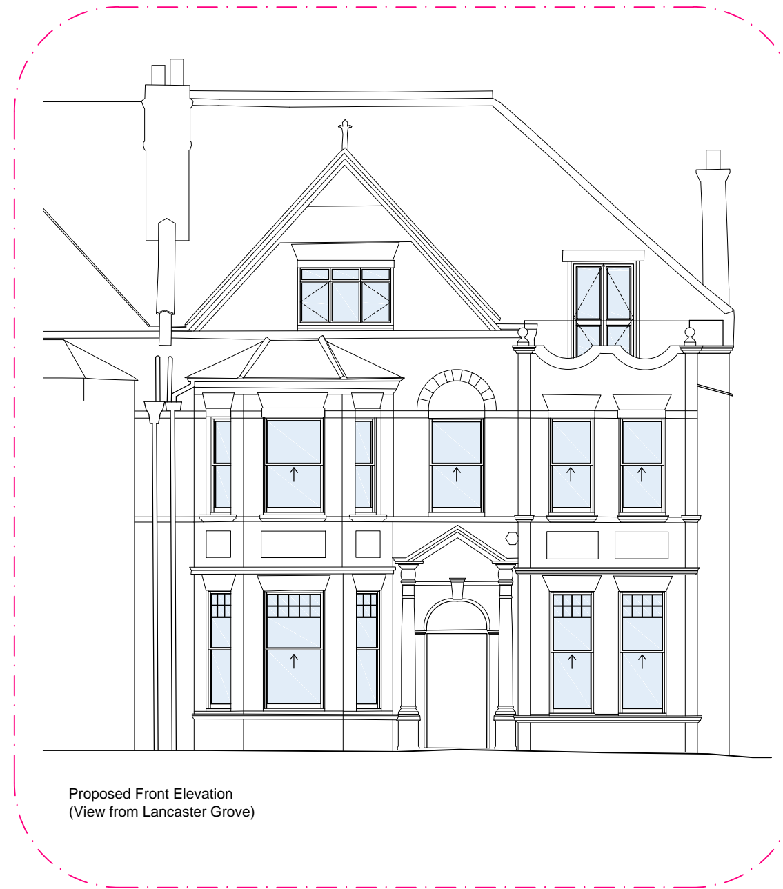
Proposed Front Elevation (View from Lancaster Grove)

FOR FURTHER DETAILS REFER TO DRAWING FIS_51