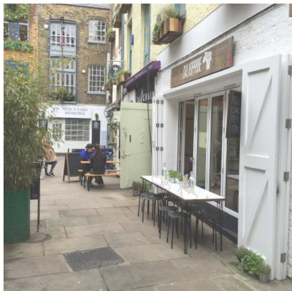
example photo by client, showing distance from adjacent existing planter, verified on site to be more than 1.8m

Note: Neal's Yard is a pedestrian space with no roads or kerbs