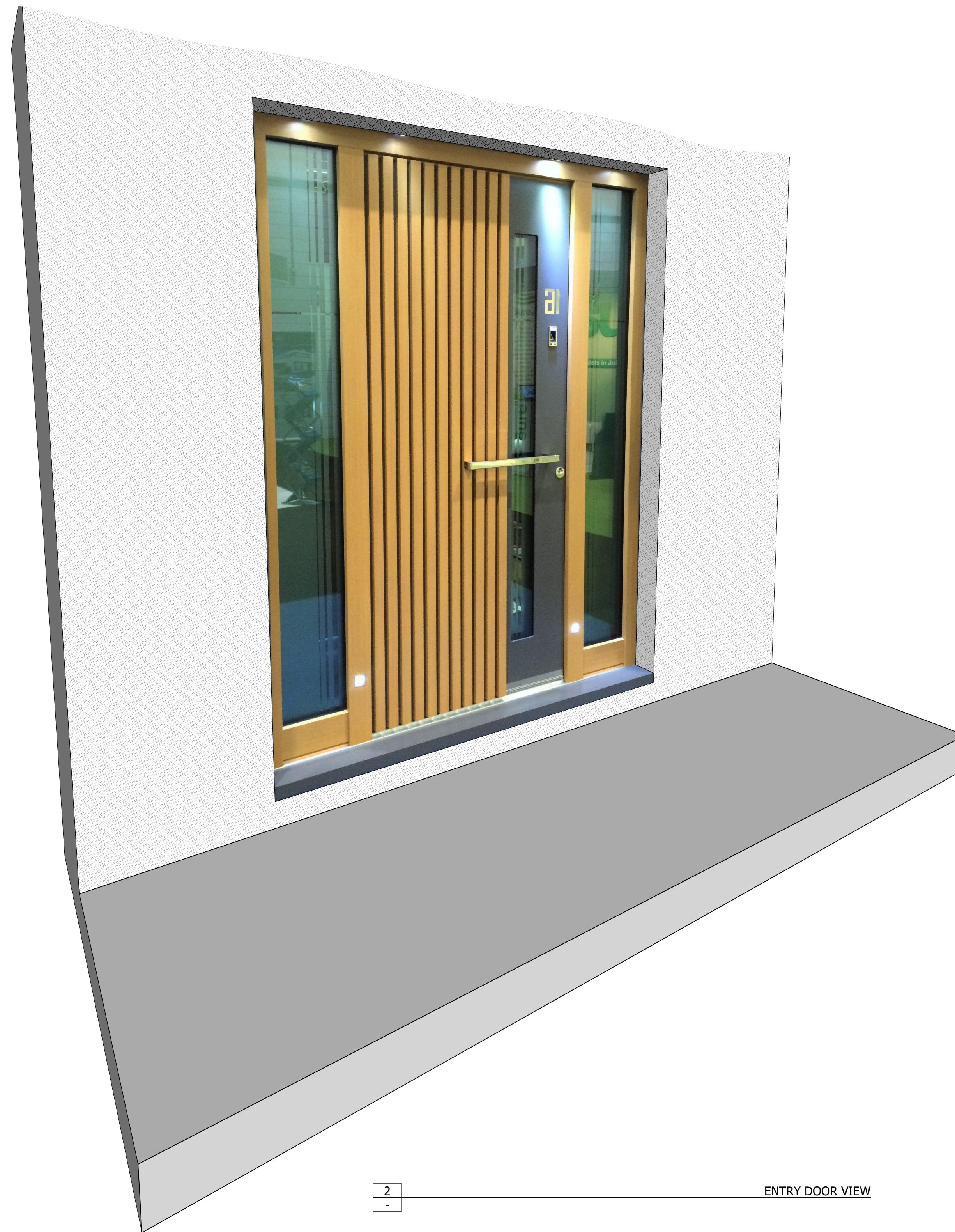
ENTRY DOOR ELEVATION 1:10