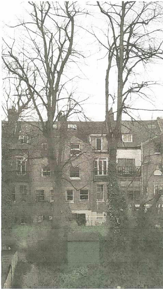
Mature trees in Garden of 25 Kingdon Road Refuge for birds and wildlife in the neighbourhood