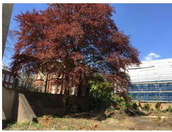
Photograph 2: Existing wall providing Tree Protection By T4