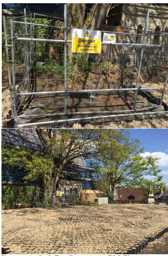
Photographs 3 - 6: Tree Protection by T6 & T7