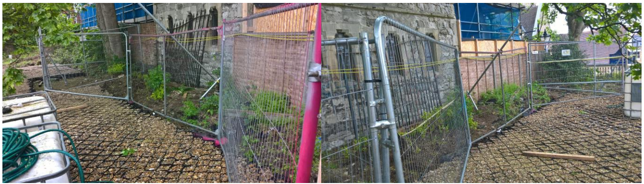
Photographs 7 and 8: Additional Heras for Boarder as suggested at the site meeting (05/05/16)