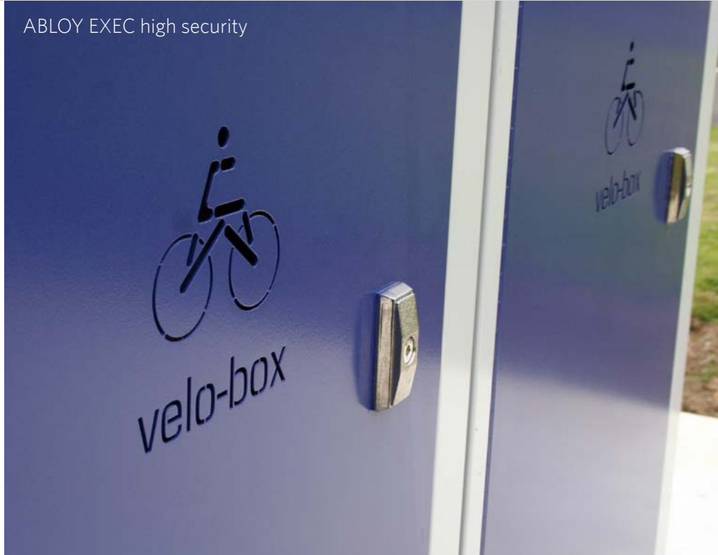
ABLOY EXEC high security