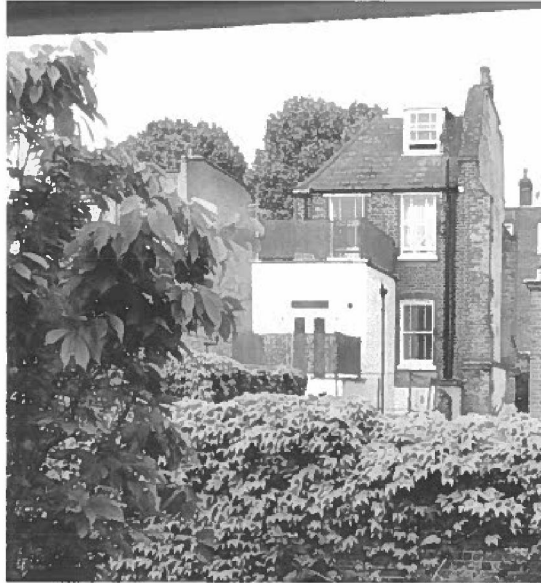
View of 57 Torriano Avenue from 1 Torriano Cottages taken 7.6.16.